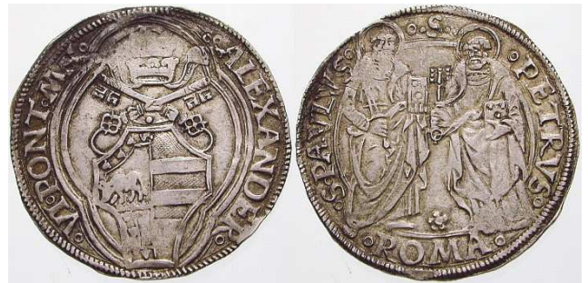
PAPAL COINS Alexander VI., 1492-1503.

Estimate: 200-250 USD. Price realized: 200 USD.