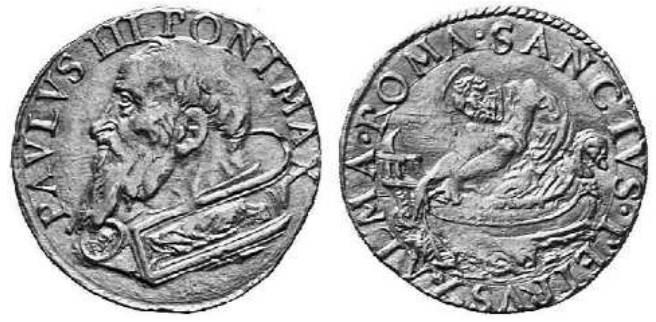
PAPAL COINS Paul III., 1534-1549.

Estimate: 8000 EUR. Price realized: 12,750 EUR (approx. 19,543 U.S. Dollars as of the auction date)