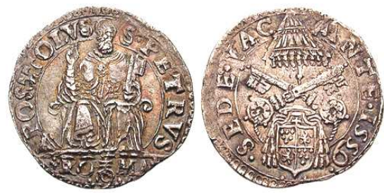
PAPAL COINS Sede Vacante 1559.

Estimate: 350,00 EUR. Price realized: 725 EUR (approx. 832 U.S. Dollars as of the auction date)