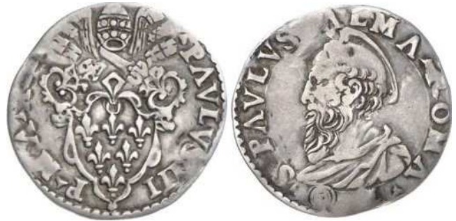
PAPAL COINS Paul III., 1534-1549.

Estimation: 125,00. Price realized: 250 EUR (approx. 314 U.S. Dollars as of the auction date)