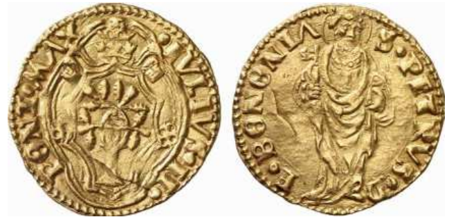
PAPAL COINS Julius II. 1503-1513.

Estimate: 800 EUR. Price realized: 850 EUR (approx. 1,303 U.S. Dollars as of the auction date)