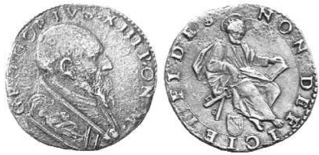
PAPAL COINS Gregory XIII., 1572-1585.