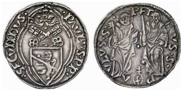
PAPAL COINS Paul II., 1464-1471.

Estimate: 100 EUR. Price realized: 200 EUR (approx. 307 U.S. Dollars as of the auction date)