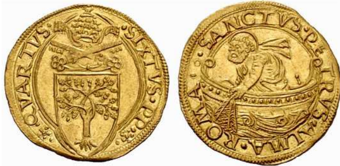
PAPAL COINS Sixtus IV., 1471-1484.

Fiorino di camera. Rome mint. 23 mm 3,38 g.