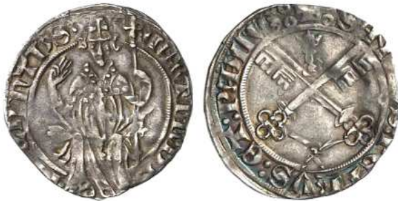
PAPAL COINS Martin V., 1417-1431.

Estimate: EUR 500. Price realized: 400 EUR (approx. 491 U.S. Dollars as of the auction date)