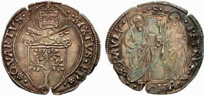
PAPAL COINS Sixtus IV., 1471-1484.

Estimate: 200 EUR. Price realized: 420 EUR (approx. 564 U.S. Dollars as of the auction date)