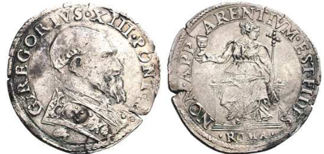
PAPAL COINS Gregory XIII., 1572-1585.

Estimate CHF 250. Price realized: 320 CHF (approx. 237 U.S. Dollars as of the auction date)