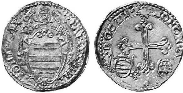
PAPAL COINS Paul IV., 1555-1559.