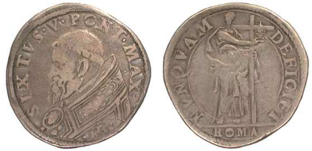
PAPAL COINS Sixtus V., 1585-1590.

Estimate: 75 EUR. Price realized: 210 EUR (approx. 322 U.S. Dollars as of the auction date)