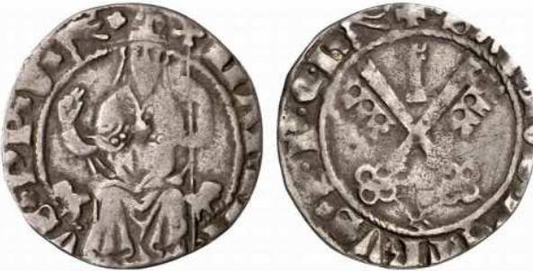
PAPAL COINS Martin V., 1417-1431.