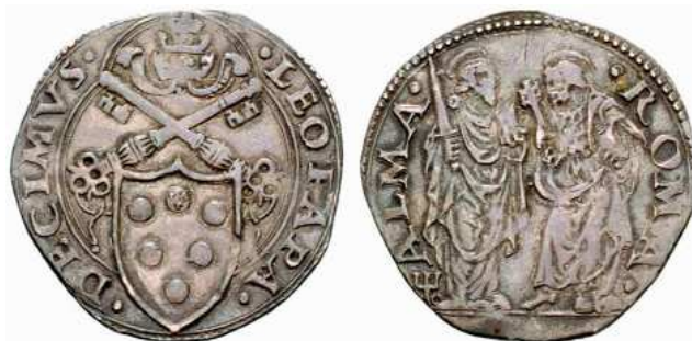
PAPAL COINS Leo X., 1513-1521.

Estimate: 2.000 EUR. Price realized: 1,600 EUR (approx. 1,925 U.S.