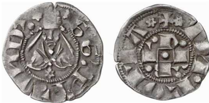
PAPAL COINS Gregory XI., 1370-1378.