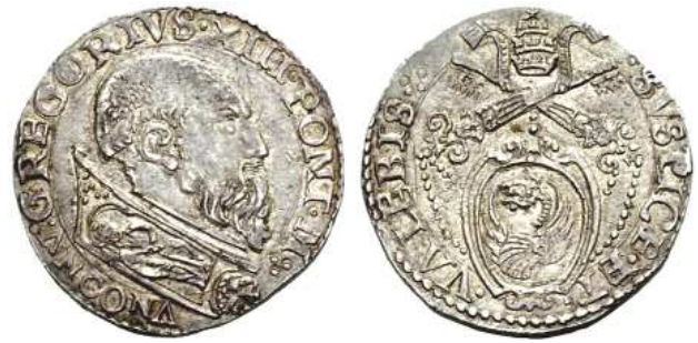
PAPAL COINS Gregory XIII., 1572-1585.

Estimate CHF 250. Price realized: 900 CHF (approx. 665 U.S. Dollars as of the auction date)