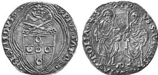
PAPAL COINS Pius II., 1458-1464.

Estimation DM 400. Price realized: 950 DEM (approx. 431 U.S. Dollars as of the auction date)