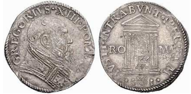
PAPAL COINS Gregory XIII., 1572-1585.