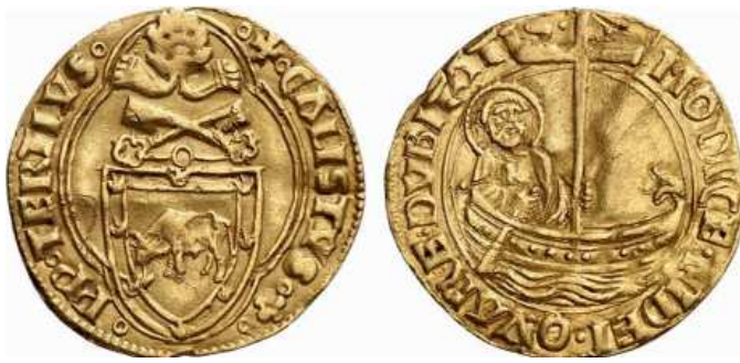
PAPAL COINS Calixtus III., 1455-1458.