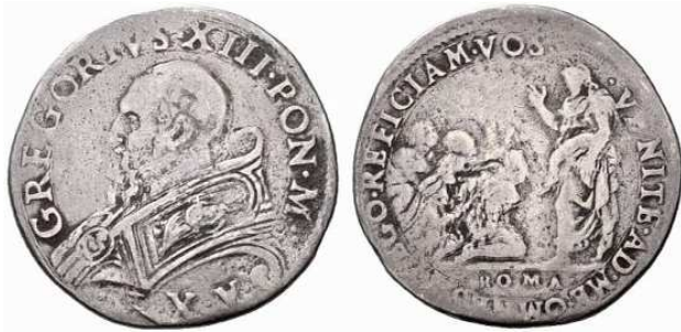
PAPAL COINS Gregory XIII., 1572-1585.

Estimate $1000. Price realized: 1,250 USD.