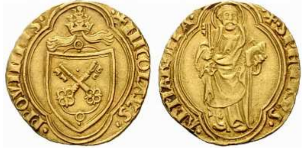
PAPAL COINS Nicolas V., 1447-1455.

Estimate CHF 2500. Price realized: 2,000 CHF (approx. 1,705 U.S. Dollars as of the auction date)