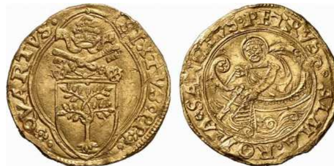
PAPAL COINS Sixtus IV., 1471-1484.

Estimate: EUR 1200. Price realized: 3,400 EUR (approx. 4,530 U.S. Dollars as of the auction date)