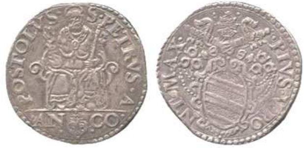
PAPAL COINS Pius V 1566-1572.