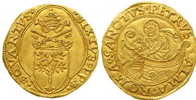
PAPAL COINS Sixtus IV., 1471-1484.

Estimate: 500 EUR. Price realized: 750 EUR (approx. 1,150 U.S. Dollars as of the auction date)