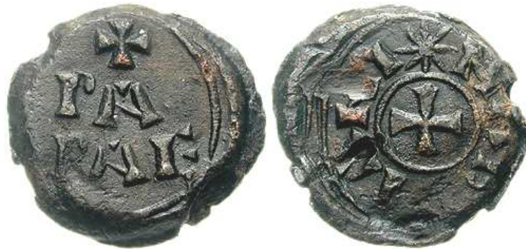
PAPAL COINS Adrian II. 867-872.

Adrian died in 872 after 5 years as pope.