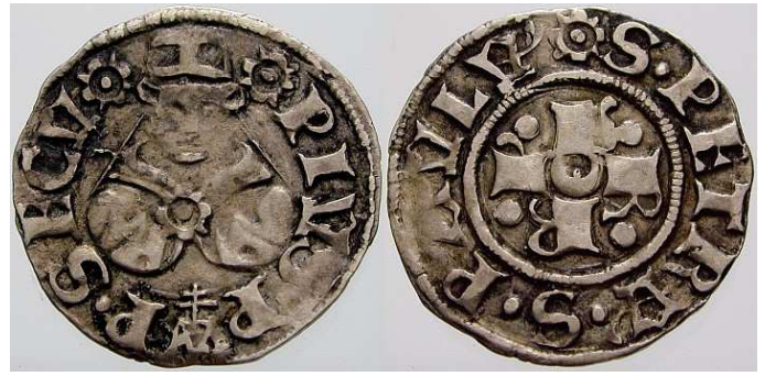
PAPAL COINS Pius II., 1458-1464.

Estimation DM 100. Price realized: 290 DEM (approx. 132 U.S. Dollars as of the auction date)