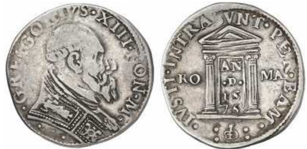
PAPAL COINS Gregory XIII., 1572-1585.