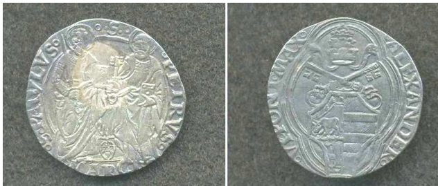
PAPAL COINS Alexander VI., 1492-1503.