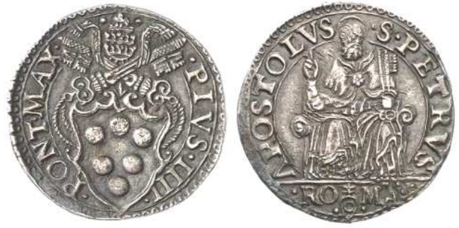
PAPAL COINS Pius IV., 1559-1565.

Estimate £ 250-300. Price realized: 220 GBP (approx. 365 U.S. Dollars as of the auction date)