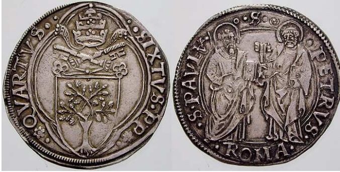
PAPAL COINS Sixtus IV., 1471-1484.