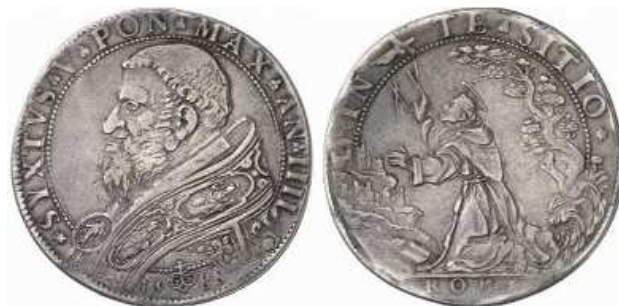
PAPAL COINS Sixtus V., 1585-1590.

Estimate: 1,000.00 EUR. Price realized: 2,500 EUR (approx. 3,001 U.S. Dollars as of the auction date)