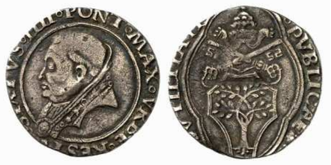
PAPAL COINS Sixtus IV., 1471-1484.

Estimate: EUR 800. Price realized: 1,100 EUR (approx. 1,632 U.S. Dollars as of the auction date)