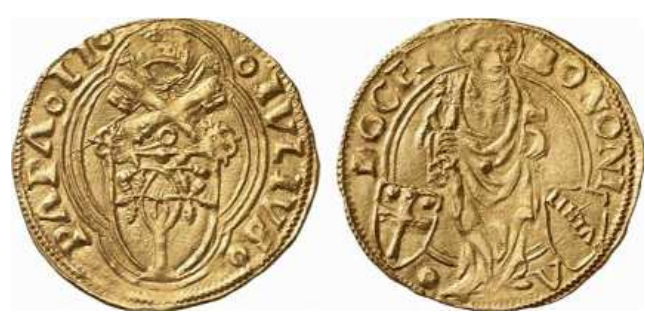
PAPAL COINS Julius II. 1503-1513.

Estimate: 800 EUR. Price realized: 1,600 EUR (approx. 2,452 U.S. Dollars as of the auction date)