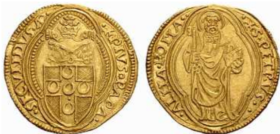
PAPAL COINS Pius II., 1458-1464.

Estimate: 600.00 EUR. Price realized: 550 EUR (approx. 660 U.S. Dollars as of the auction date)