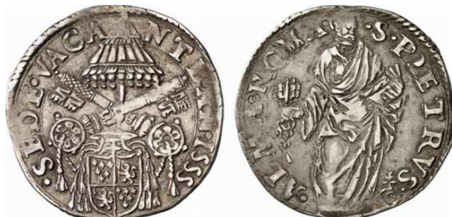
PAPAL COINS Sede Vacante 1555.