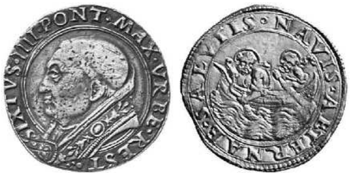
PAPAL COINS Sixtus IV., 1471-1484.