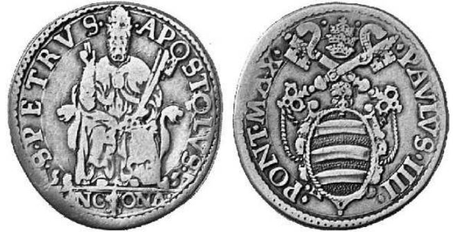
PAPAL COINS Paul IV., 1555-1559.

Estimation: 125,00. Price realized: 100 EUR (approx. 125 U.S. Dollars as of the auction date)