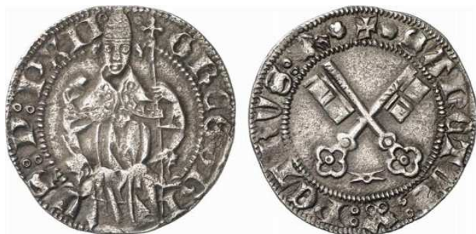
PAPAL COINS Gregory XII., 1406-1417.

Estimate: EUR 600. Price realized: 840 EUR (approx. 1,246 U.S. Dollars as of the auction date)