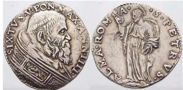
PAPAL COINS Sixtus V., 1585-1590.

Estimate: EUR 300. Price realized: 340 EUR (approx. 505 U.S. Dollars as of the auction date)