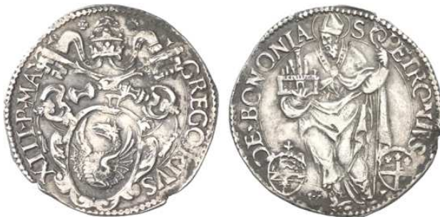
PAPAL COINS Gregory XIII., 1572-1585.

Estimation CHF 400. Price realized: 1,600 CHF (approx. 1,215 U.S. Dollars as of the auction date)