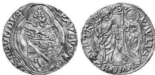
PAPAL COINS Paul II., 1464-1471.

Estimate: 1,000.00 EUR. Price realized: 1,200 EUR (approx. 1,456 U.S. Dollars as of the auction date)