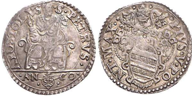
PAPAL COINS Pius V 1566-1572.