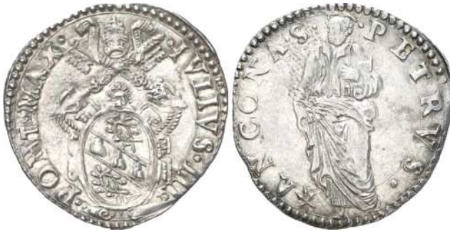
PAPAL COINS Julius III 1550-1555.