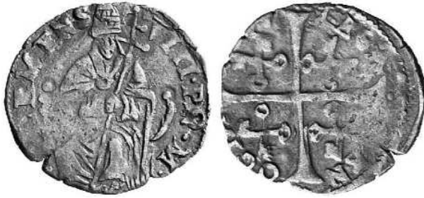
PAPAL COINS Clement VIII., 1592-1605..