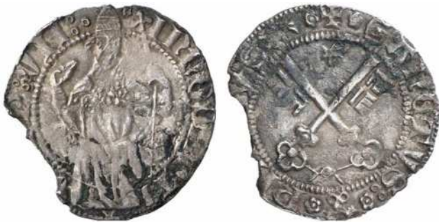
PAPAL COINS Innocent VII., 1404 - 1406.