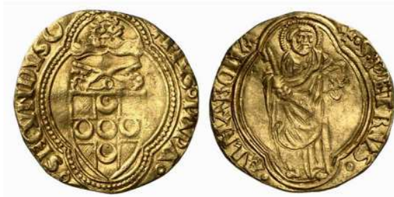
PAPAL COINS Pius II., 1458-1464.

Estimate: EUR 1200. Price realized: 1,600 EUR (approx. 2,132 U.S. Dollars as of the auction date)