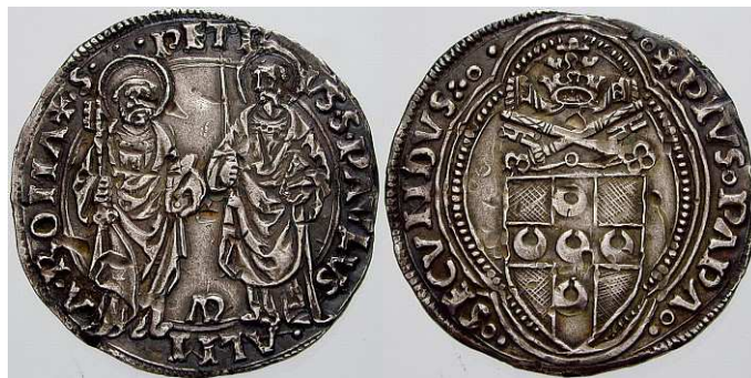
PAPAL COINS Pius II., 1458-1464.

Schätzpreis: 150.00 EUR. Price realized: 280 EUR (approx. 336 U.S. Dollars as of the auction date)