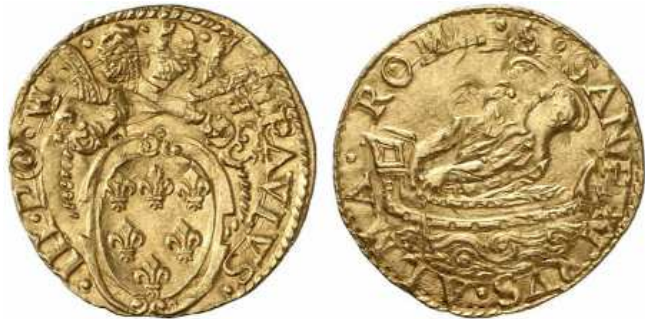
PAPAL COINS Paul III., 1534-1549.

Estimate CHF 10000. Price realized: 14,500 CHF (approx. 10,718 U.S. Dollars as of the auction date)