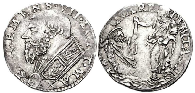
PAPAL COINS Clement VII, 1523-1534.

Estimate $1500. Price realized: 3,000 USD.