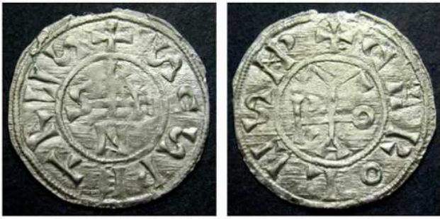
PAPAL COINS STEPHEN V with CHARLES THE FAT (885-891)