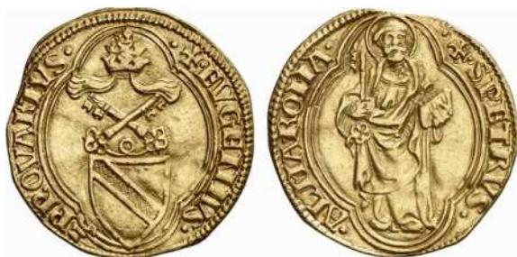
PAPAL COINS Eugenius IV., 1431-1447.

Eugene IV was against the enslavement of natives from the Canary Islands: in January 13, 1435, at Florence, Eugene enacted the Papal Bull "Sicut Dudum" about the enslaving by Spanish slave trader. The Pope wrote: "... These people are to be totally and perpetually free, and are to be let go without the exaction or reception of money"... But the Spanish didn't listen to the Pope and asserted that the natives weren't men but a sort of animal.