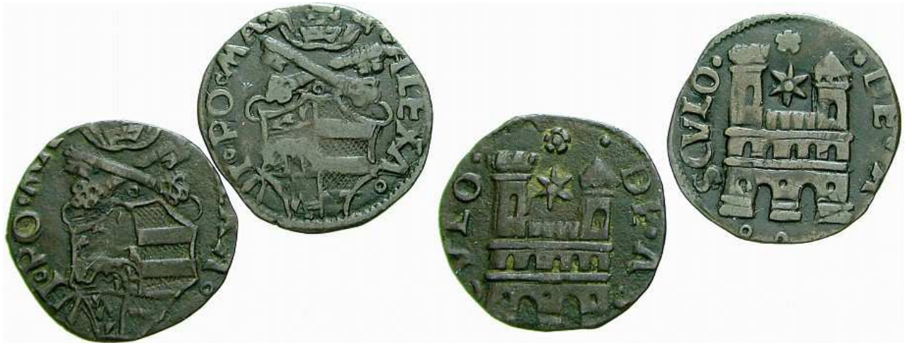
PAPAL COINS Alexander VI., 1492-1503.