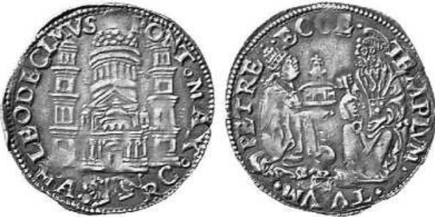
PAPAL COINS Leo X., 1513-1521.

Estimation CHF 500. Price realized: 1,800 CHF (approx. 1,366 U.S. Dollars as of the auction date)