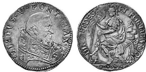
PAPAL COINS Sixtus V., 1585-1590.