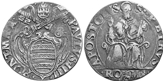
PAPAL COINS Paul IV., 1555-1559.

Estimate CHF 100. Price realized: 140 CHF (approx. 117 U.S. Dollars as of the auction date)