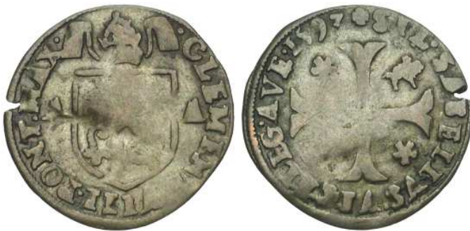
PAPAL COINS Clement VIII., 1592-1605..

Estimate: 200.00 EUR. Price realized: 420 EUR (approx. 504 U.S. Dollars as of the auction date)