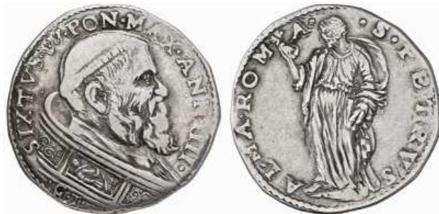
PAPAL COINS Sixtus V., 1585-1590.

Estimation: £ 40. Price realized: 70 GBP (approx. 100 U.S. Dollars as of the auction date)