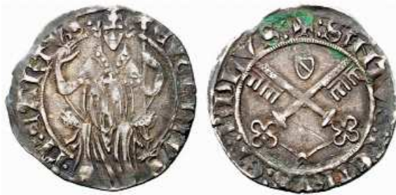
PAPAL COINS Eugenius IV., 1431-1447.

Estimate: 300 EUR. Price realized: 240 EUR (approx. 368 U.S. Dollars as of the auction date)