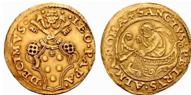
PAPAL COINS Leo X., 1513-1521.

Estimated Value $2,500-3,000. Price realized: 2,900 USD.