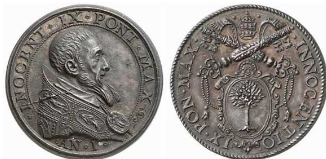
PAPAL COINS Innocent IX., 1591