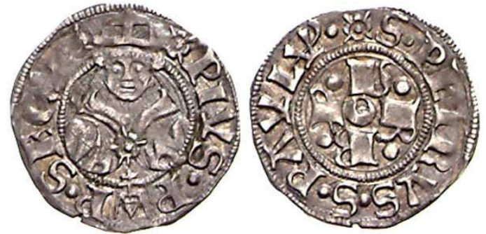
PAPAL COINS Pius II., 1458-1464.

Estimation CHF 250. Price realized: 275 CHF (approx. 207 U.S. Dollars as of the auction date)