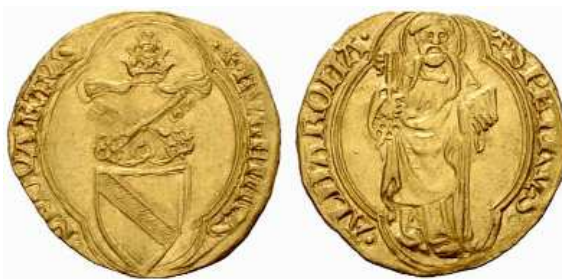
PAPAL COINS Eugenius IV., 1431-1447.

Estimate: 1000 EUR. Price realized: 1,200 EUR (approx. 1,839 U.S. Dollars as of the auction date)