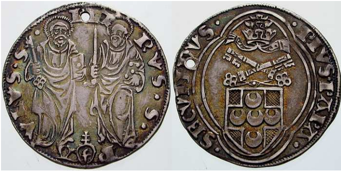
PAPAL COINS Pius II., 1458-1464.