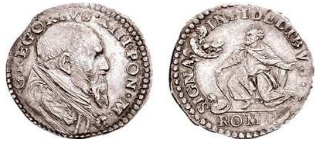
PAPAL COINS Gregory XIII., 1572-1585.

Estimate CHF 180. Price realized: 180 CHF (approx. 133 U.S. Dollars as of the auction date)