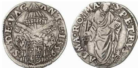
PAPAL COINS Sede Vacante 1559.

Estimate: EUR 300. Price realized: 400 EUR (approx. 514 U.S. Dollars as of the auction date)