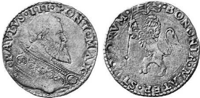
PAPAL COINS Paul III., 1534-1549.

Estimate: EUR 400. Price realized: 460 EUR (approx. 617 U.S. Dollars as of the auction date)