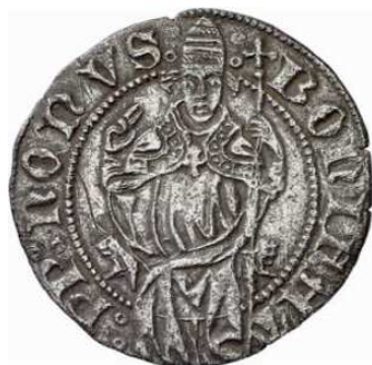
PAPAL COINS Boniface IX., 1389-1404.

(Note on numbering: Pope Boniface VII is now considered an anti-pope. At the time however, this fact was not recognized and so the seventh true Pope Boniface took the official number VIII. This caused the true eighth Pope Boniface to take the number IX. This has advanced the numbering of all subsequent Popes Boniface by one. Popes Boniface VIII-IX are really the seventh through eight popes by that name.)