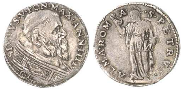
PAPAL COINS Sixtus V., 1585-1590.

Estimate CHF 650. Price realized: 1,700 CHF (approx. 1,257 U.S. Dollars as of the auction date)