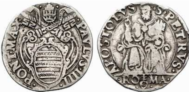
PAPAL COINS Paul IV., 1555-1559.

Estimate: EUR 100. Price realized: 75 EUR (approx. 111 U.S. Dollars as of the auction date)