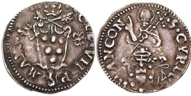
PAPAL COINS Clement VII, 1523-1534.