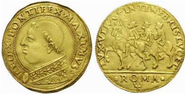
PAPAL COINS Leo X., 1513-1521.