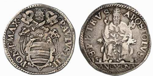
PAPAL COINS Paul IV., 1555-1559.

Estimate: EUR 125. Price realized: 150 EUR (approx. 193 U.S. Dollars as of the auction date)