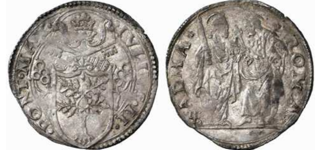
PAPAL COINS Julius II. 1503-1513.

Starting Price EUR 75. Price realized: 160 EUR (approx. 234 U.S. Dollars as of the auction date)