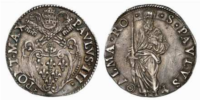
PAPAL COINS Paul III., 1534-1549.