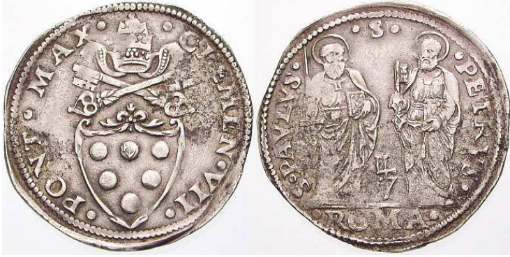
PAPAL COINS Clement VII, 1523-1534.