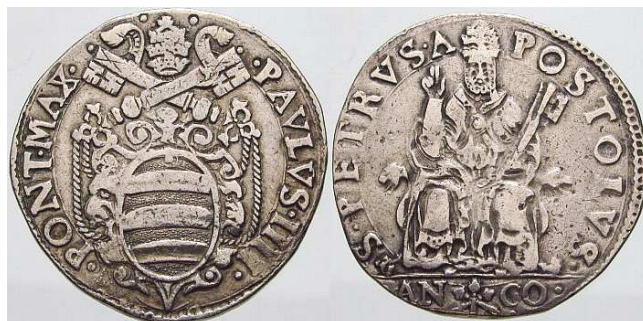
PAPAL COINS Paul IV., 1555-1559.