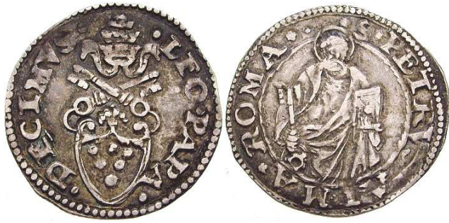
PAPAL COINS Leo X., 1513-1521.