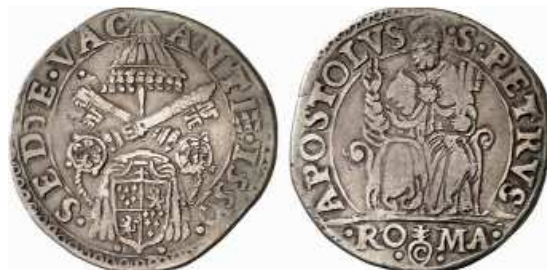
PAPAL COINS Sede Vacante 1559.