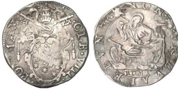
PAPAL COINS Clement VIII., 1592-1605..