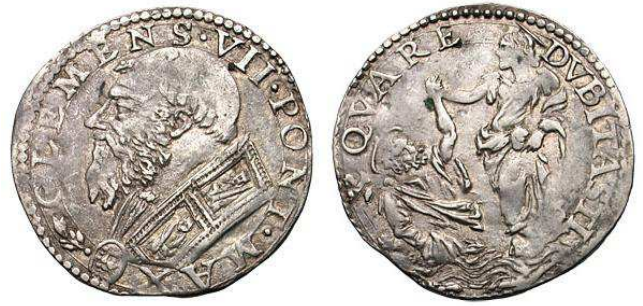
PAPAL COINS Clement VII, 1523-1534.

Estimate: CHF 1'250.00. Price realized: 1,000 CHF (approx. 665 U.S. Dollars as of the auction date)