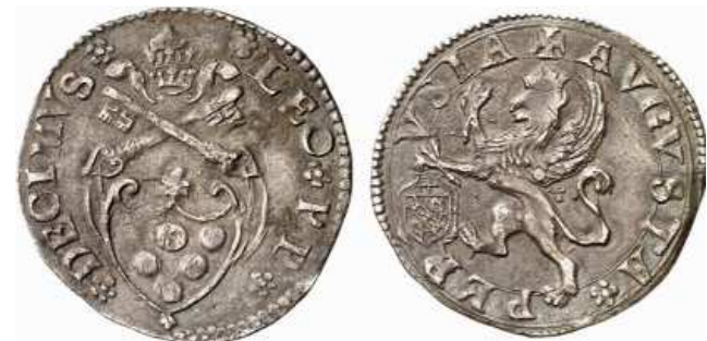
PAPAL COINS Leo X., 1513-1521.

Estimation DM 100. Price realized: 160 DEM (approx. 73 U.S. Dollars as of the auction date)