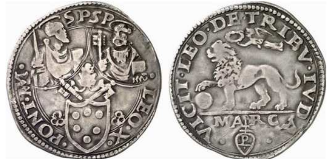
PAPAL COINS Leo X., 1513-1521.

Schätzpreis: 600,00 EUR. Price realized: 875 EUR (approx. 1,076 U.S. Dollars as of the auction date)