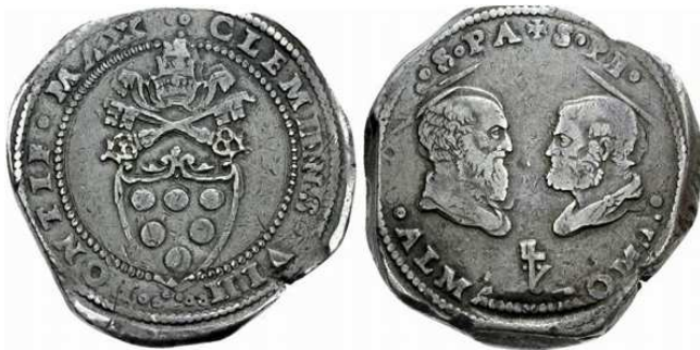
PAPAL COINS Clement VII, 1523-1534.

Estimate: EUR 1.500. Price realized: 2,800 EUR (approx. 3,700 U.S. Dollars as of the auction date)