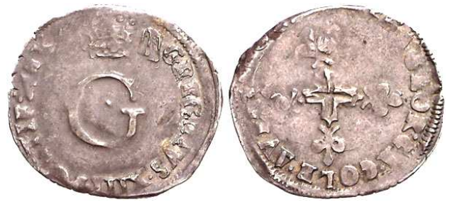
PAPAL COINS Gregory XIII., 1572-1585.

Estimate: EUR 75. Price realized: 60 EUR (approx. 72 U.S. Dollars as of the auction date)