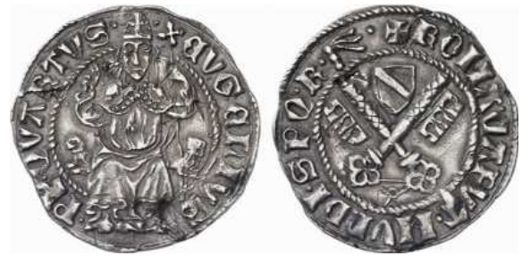
PAPAL COINS Eugenius IV., 1431-1447.

Estimate: EUR 700. Price realized: 1,800 EUR (approx. 2,398 U.S. Dollars as of the auction date)