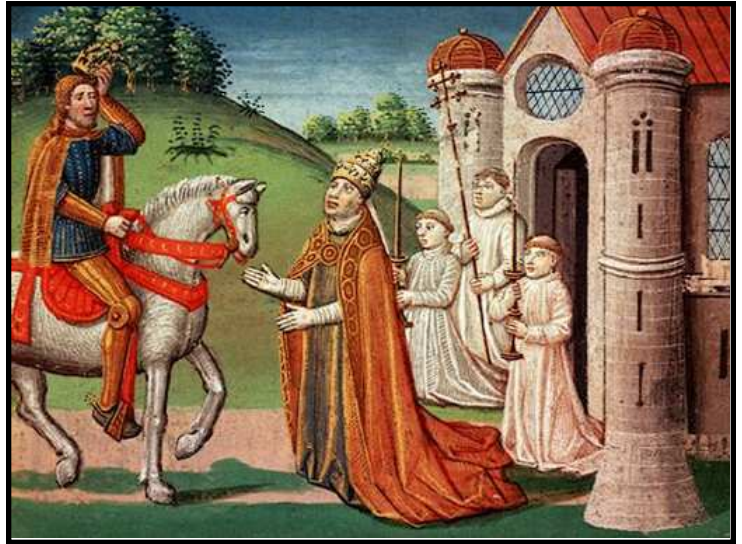
Charlemagne comes to the aid of Pope Adrian I

An epitaph written by Charlemagne in verse, in which he styles Adrian "father," is still to be seen at the door of the Vatican basilica. Adrian restored some of the ancient aqueducts of Rome, and rebuilt the churches of Santa Maria in Cosmedin, decorated by Greek monks fleeing from the iconoclastal persecutions, and of San Marco in Rome. At the time of his death, his was the longest papacy since Saint Peter, and it would remain so until he was surpassed by the 24-year papacy of Pius VI in the late 18th century. In fact, only three more popes (Pius IX, John Paul II and Leo XIII) have reigned longer since.