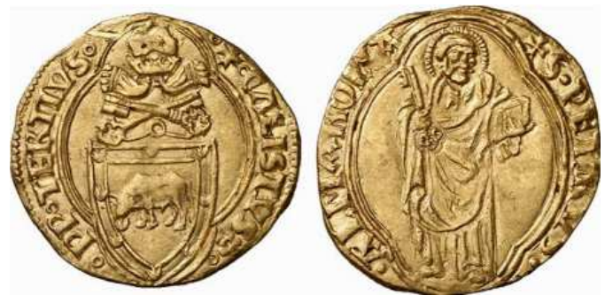
PAPAL COINS Calixtus III., 1455-1458.

Estimate: 1000 EUR. Price realized: 1,850 EUR (approx. 2,836 U.S. Dollars as of the auction date)