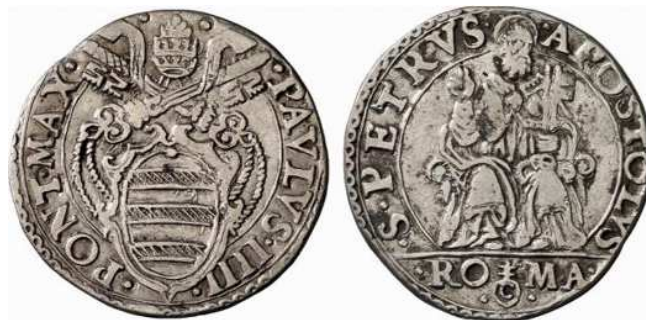
PAPAL COINS Paul IV., 1555-1559.

Estimate: 125.00 EUR. Price realized: 150 EUR (approx. 180 U.S. Dollars as of the auction date)