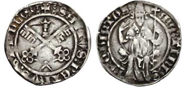
PAPAL COINS Martin V., 1417-1431.

Estimate EUR 100. Price realized: 130 EUR (approx. 163 U.S. Dollars as of the auction date)