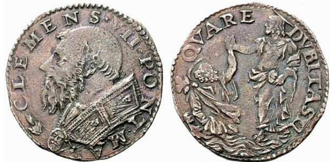
PAPAL COINS Clement VII, 1523-1534.

Estimation CHF 10000. Price realized: 14,000 CHF (approx. 10,627 U.S. Dollars as of the auction date)