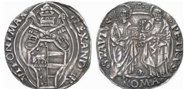
PAPAL COINS Alexander VI., 1492-1503.

Estimate: 2000 EUR. Price realized: 2,600 EUR (approx. 3,985 U.S. Dollars as of the auction date)