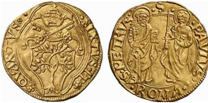
PAPAL COINS Sixtus IV., 1471-1484.