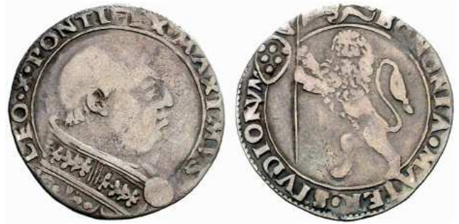
PAPAL COINS Leo X., 1513-1521.

Estimation DM 250. Price realized: 360 DEM (approx. 163 U.S. Dollars as of the auction date)