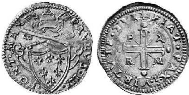
PAPAL COINS Paul III., 1534-1549.

Estimate: EUR 450. Price realized: 525 EUR (approx. 674 U.S. Dollars as of the auction date)