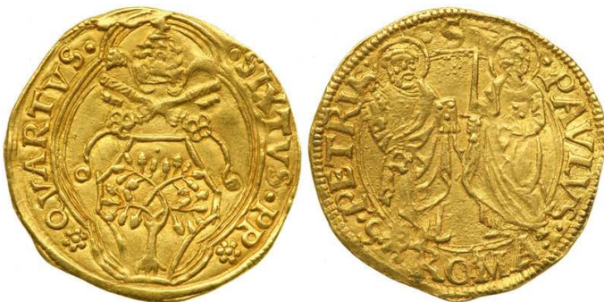
PAPAL COINS Sixtus IV., 1471-1484.

Estimate: EUR 1000. Price realized: 1,300 EUR (approx. 1,668 U.S. Dollars as of the auction date)