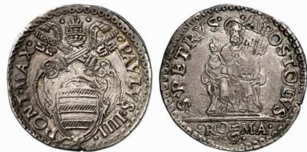
PAPAL COINS Paul IV., 1555-1559.