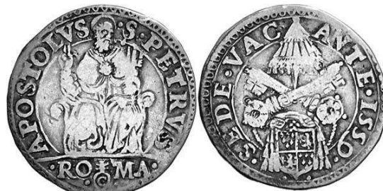
PAPAL COINS Sede Vacante 1559.