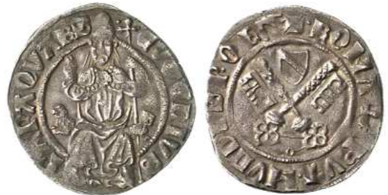
PAPAL COINS Eugenius IV., 1431-1447.