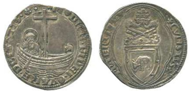
PAPAL COINS Calixtus III., 1455-1458.

Estimation DM 100. Price realized: 950 DEM (approx. 431 U.S. Dollars as of the auction date)