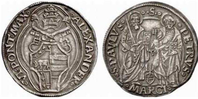
PAPAL COINS Alexander VI., 1492-1503.