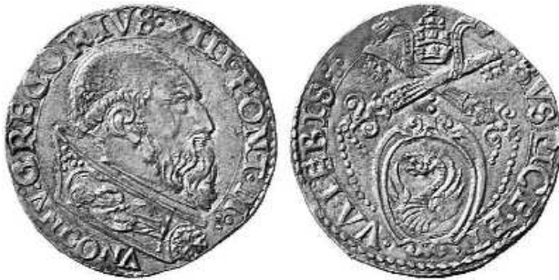
PAPAL COINS Gregory XIII., 1572-1585.

Estimate: EUR 500. Price realized: 500 EUR (approx. 614 U.S. Dollars as of the auction date)