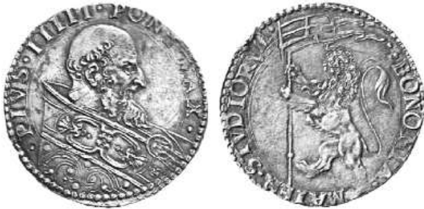
PAPAL COINS Pius V 1566-1572.

Estimate: £ 500. Price realized: 400 GBP (approx. 760 U.S. Dollars as of the auction date)