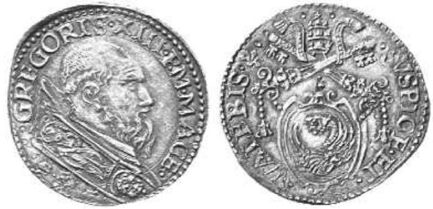
PAPAL COINS Gregory XIII., 1572-1585.