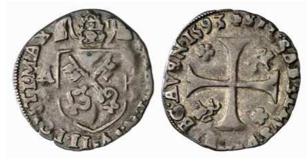
PAPAL COINS Clement VIII., 1592-1605..

Estimate CHF 400. Price realized: 320 CHF (approx. 237 U.S. Dollars as of the auction date)