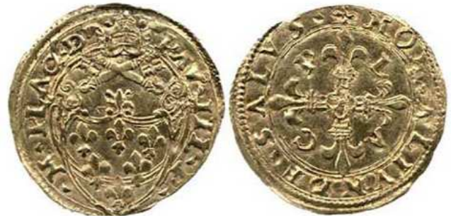
PAPAL COINS Paul III., 1534-1549.

Estimate EUR 600. Price realized: 775 EUR (approx. 940 U.S. Dollars as of the auction date)