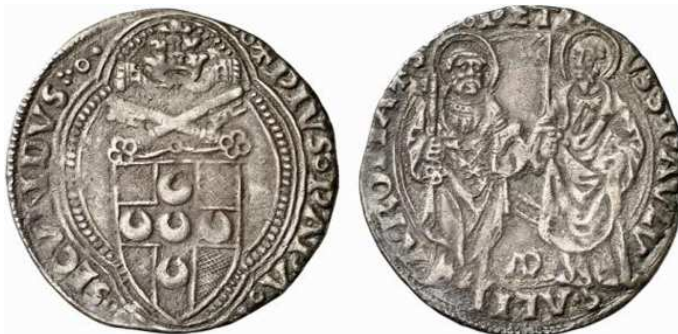
PAPAL COINS Pius II., 1458-1464.

Estimate CHF 250. Price realized: 400 CHF (approx. 296 U.S. Dollars as of the auction date)