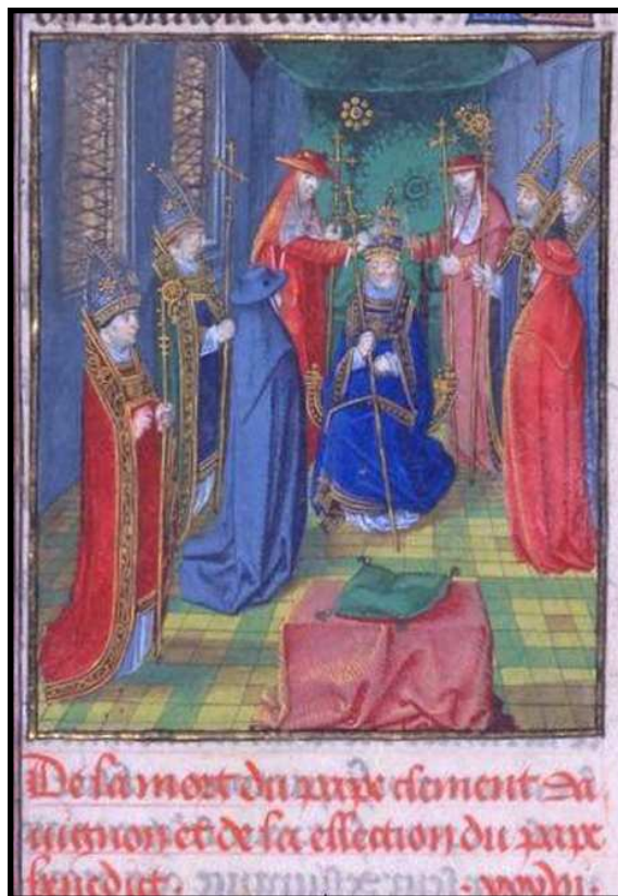
The consecration of Benedict XIII.

In 1415 the Council of Constance brought this clash between papal claimants to an end. Gregory XII and Baldassare Cossa, who had succeeded Philarghi as the Pisan papal contender in 1410 and had assumed the name John XXIII, both agreed to resign. Benedict, on the other hand, refused to stand down, so he was declared a schismatic and excommunicated from the Catholic Church by the Council of Constance on July 27, 1417. Benedict, who had lived in Perpignan from 1408 to 1417, now fled to the castle at Peñíscola near Valencia in Spain. He still considered himself the true pope, but his claim was now only recognised in the kingdom of Aragon, where he was given protection by King Alfonso V. Benedict remained at Peñíscola from 1417 until his death there on May 23, 1423.