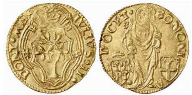
PAPAL COINS Julius II. 1503-1513.

Estimate: EUR 500. Price realized: 800 EUR (approx. 1,074 U.S. Dollars as of the auction date)