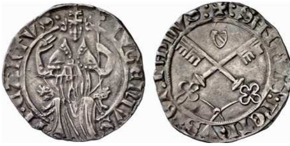
PAPAL COINS Eugenius IV., 1431-1447.