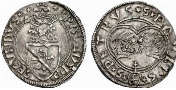
PAPAL COINS Paul II., 1464-1471.