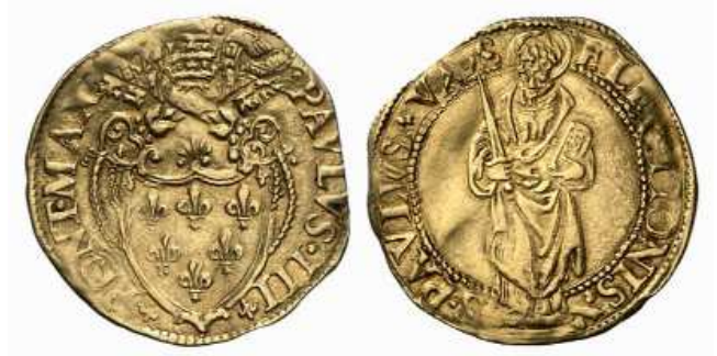
PAPAL COINS Paul III., 1534-1549.

Estimate: EUR 400. Price realized: 340 EUR (approx. 418 U.S. Dollars as of the auction date)