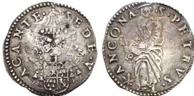
PAPAL COINS Sede Vacante 1555.

Estimate: 200 EUR. Price realized: 460 EUR (approx. 705 U.S. Dollars as of the auction date)