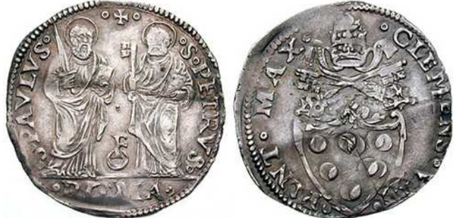
PAPAL COINS Clement VII, 1523-1534.

Schätzpreis: 100.00 EUR. Price realized: 160 EUR (approx. 192 U.S. Dollars as of the auction date)