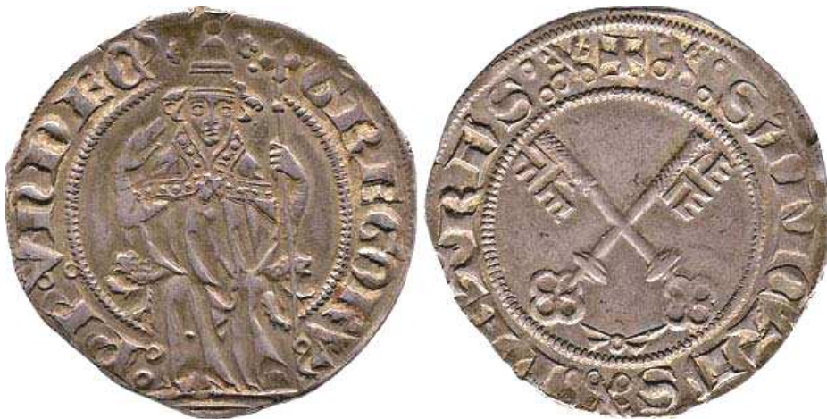
PAPAL COINS Gregory XI., 1370-1378.