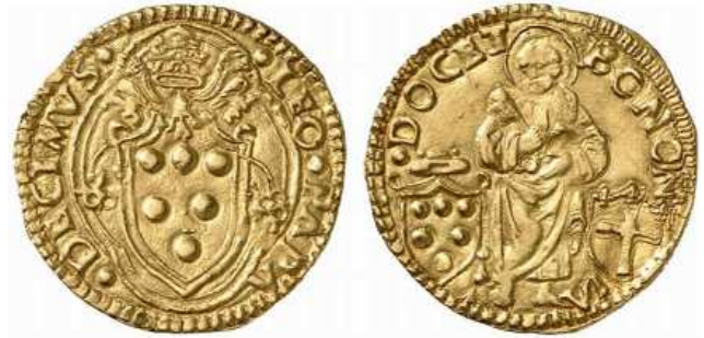
PAPAL COINS Leo X., 1513-1521.

Estimation: CHF 2000. Price realized: 2,000 CHF (approx. 1,618 U.S. Dollars as of the auction date)