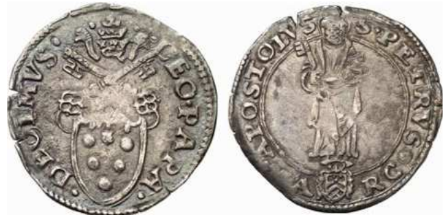
PAPAL COINS Leo X., 1513-1521.

Estimation DM 300. Price realized: 340 DEM (approx. 154 U.S. Dollars as of the auction date)