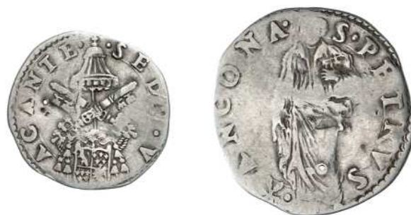
PAPAL COINS Sede Vacante 1555.

Estimation: CHF 320. Price realized: 300 CHF (approx. 238 U.S. Dollars as of the auction date)