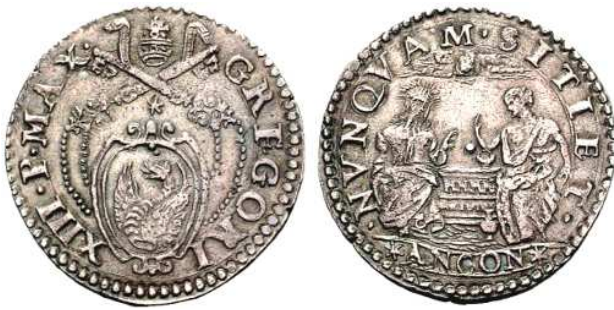
PAPAL COINS Gregory XIII., 1572-1585.

Estimate: 100 EUR. Price realized: 150 EUR (approx. 191 U.S. Dollars as of the auction date)