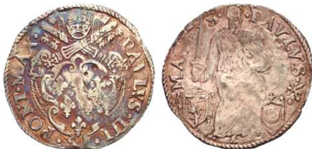
PAPAL COINS Paul III., 1534-1549.

Estimation DM 250. Price realized: 310 DEM (approx. 141 U.S. Dollars as of the auction date)