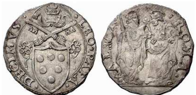
PAPAL COINS Leo X., 1513-1521.

Estimate: CHF 200. Price realized: 400 CHF (approx. 364 U.S. Dollars as of the auction date)