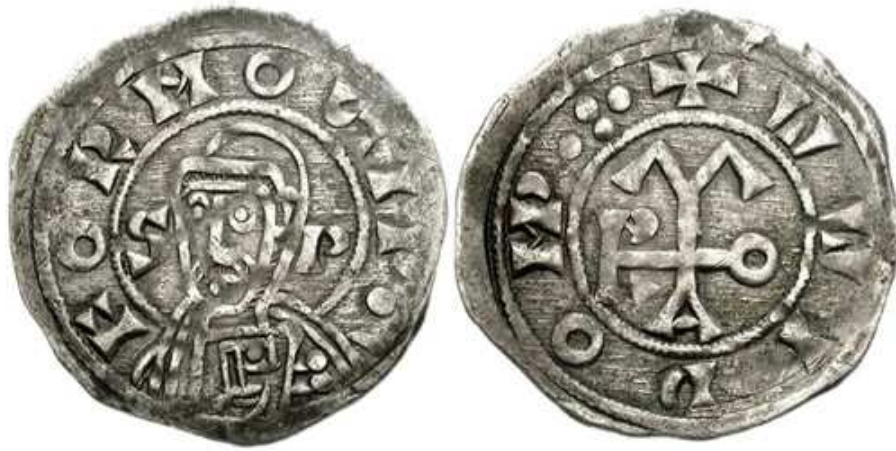
PAPAL COINS Formosus. 891-896.

Following the death of Stephen VI, Formosus' body was reinterred in St Peter's. Further trials of this nature against deceased persons were banned, but Pope Sergius III (904–911) reapproved the decisions against Formosus. Sergius demanded the re-ordination of the bishops consecrated by Formosus, who in turn had meanwhile conferred orders on many other clerics, causing great confusion. Later the validity of Formosus's work was re-reinstated. The decision of Sergius with respect to Formosus has been subsequently disregarded by the Church.