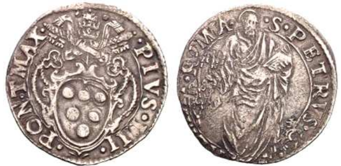
PAPAL COINS Pius IV., 1559-1565.

Estimation DM 200. Price realized: 160 DEM (approx. 73 U.S. Dollars as of the auction date)