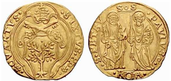
PAPAL COINS Sixtus IV., 1471-1484.

Estimate: 1250 EUR. Price realized: 1,400 EUR (approx. 2,146 U.S. Dollars as of the auction date)