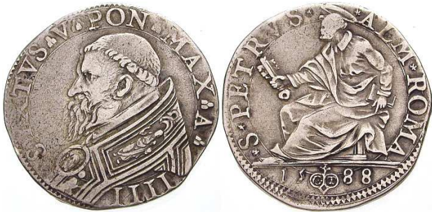
PAPAL COINS Sixtus V., 1585-1590.