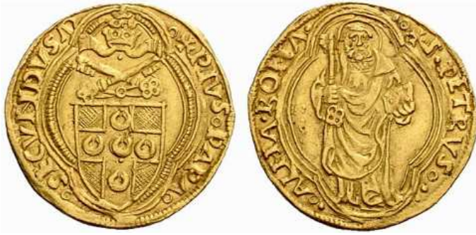
PAPAL COINS Pius II., 1458-1464.