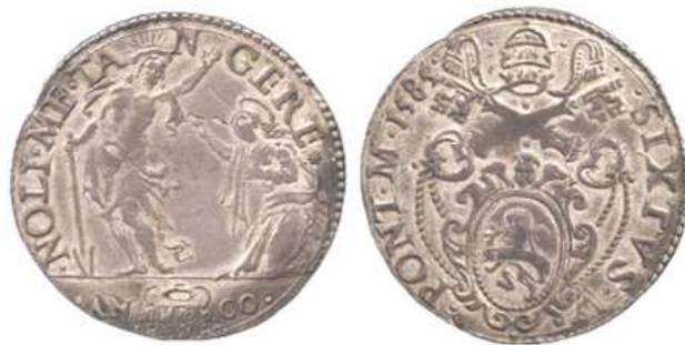
PAPAL COINS Sixtus V., 1585-1590.

Estimation DM 250. Price realized: 575 DEM (approx. 261 U.S. Dollars as of the auction date)