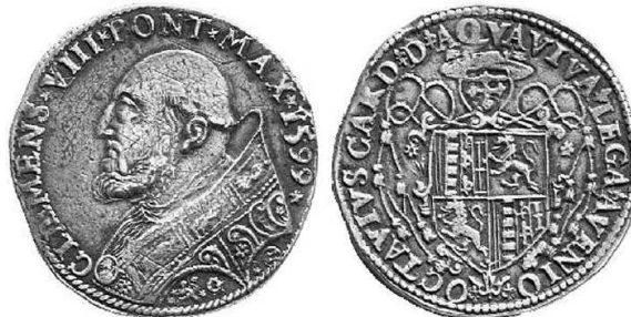
PAPAL COINS Clement VIII., 1592-1605..

Estimate: 2000 EUR. Price realized: 1,900 EUR (approx. 2,912 U.S. Dollars as of the auction date)