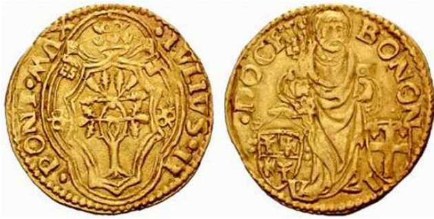
PAPAL COINS Julius II. 1503-1513.