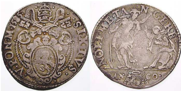
PAPAL COINS Sixtus V., 1585-1590.