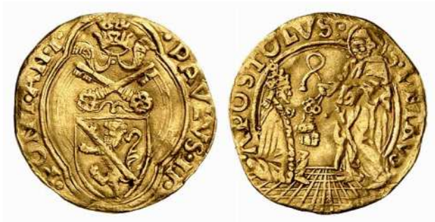
PAPAL COINS Paul II., 1464-1471.