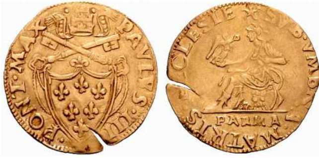
PAPAL COINS Paul III., 1534-1549.