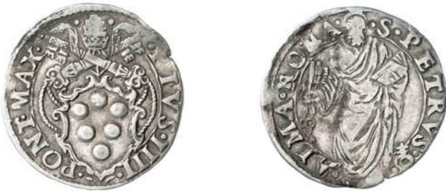
PAPAL COINS Pius IV., 1559-1565.

Estimate: EUR 50. Price realized: 50 EUR (approx. 64 U.S. Dollars as of the auction date)