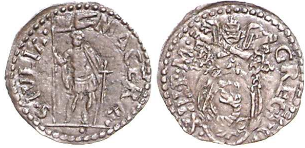
PAPAL COINS Gregory XIII., 1572-1585.

Estimate: 150 EUR. Price realized: 450 EUR (approx. 690 U.S. Dollars as of the auction date)