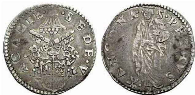
PAPAL COINS Sede Vacante 1555.

Estimation: CHF 280. Price realized: 225 CHF (approx. 178 U.S. Dollars as of the auction date)