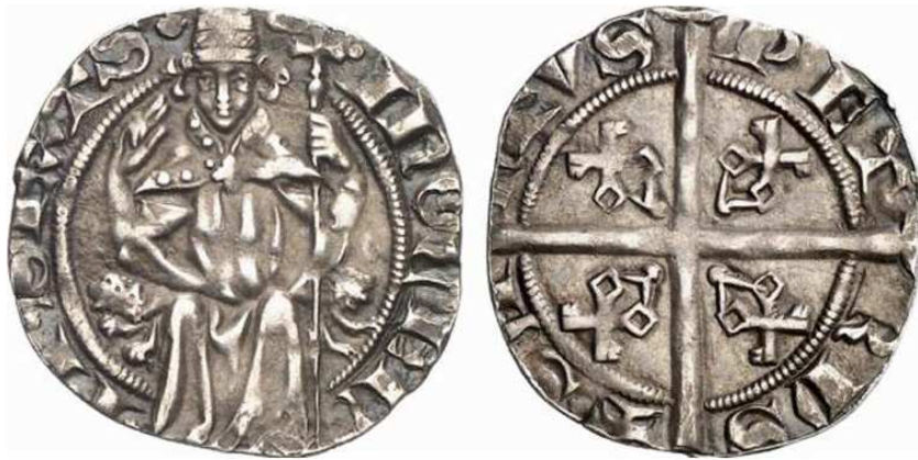
PAPAL COINS Innocent VI., 1352-1362.

Estimate: 1.000 / 1.200. Price realized: 2,900 EUR (approx. 3,688 U.S. Dollars as of the auction date)