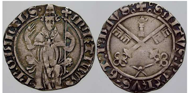
PAPAL COINS Martin V., 1417-1431.

Schätzpreis: 150.00 EUR. Price realized: 500 EUR (approx. 600 U.S. Dollars as of the auction date)