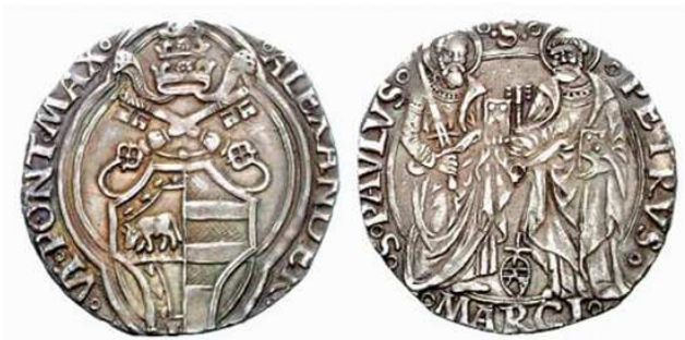
PAPAL COINS Alexander VI., 1492-1503.

Estimate: EUR 150. Price realized: 180 EUR (approx. 227 U.S. Dollars as of the auction date)