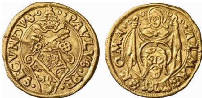
PAPAL COINS Paul II., 1464-1471.

Estimate: 2000 EUR. Price realized: 3,000 EUR (approx. 4,598 U.S. Dollars as of the auction date)