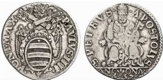
PAPAL COINS Paul IV., 1555-1559.

Estimate: 250 EUR. Price realized: 600 EUR (approx. 805 U.S. Dollars as of the auction date)