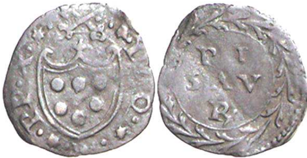
PAPAL COINS Leo X., 1513-1521.

Estimate: EUR 300. Price realized: 550 EUR (approx. 816 U.S. Dollars as of the auction date)