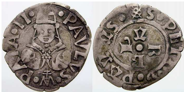
PAPAL COINS Paul II., 1464-1471.

Estimate: 100 EUR. Price realized: 380 EUR (approx. 582 U.S. Dollars as of the auction date)