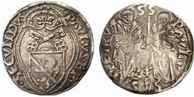
PAPAL COINS Paul II., 1464-1471.