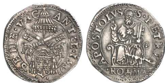
PAPAL COINS Sede Vacante 1559.

Estimate: 75 EUR. Price realized: 120 EUR (approx. 146 U.S. Dollars as of the auction date)