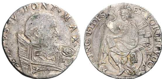
PAPAL COINS Sixtus V., 1585-1590.