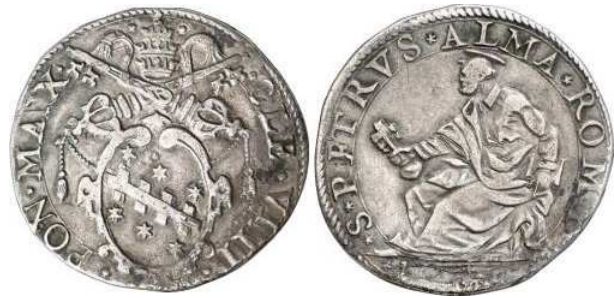
PAPAL COINS Clement VIII., 1592-1605..

Estimate: 100 EUR. Price realized: 120 EUR (approx. 184 U.S. Dollars as of the auction date)