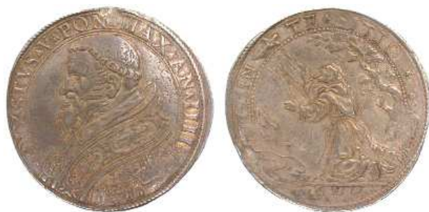
PAPAL COINS Sixtus V., 1585-1590.