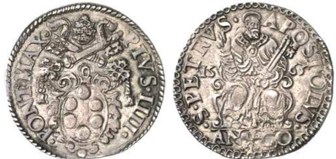
PAPAL COINS Pius IV., 1559-1565.