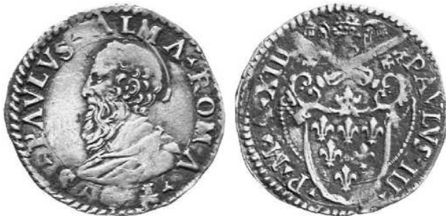
PAPAL COINS Paul III., 1534-1549.

Estimation: 125,00. Price realized: 220 EUR (approx. 276 U.S. Dollars as of the auction date)