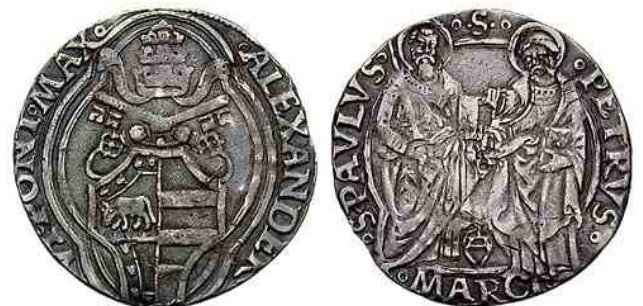
PAPAL COINS Alexander VI., 1492-1503.

Estimate: EUR 250. Price realized: 320 EUR (approx. 406 U.S. Dollars as of the auction date)