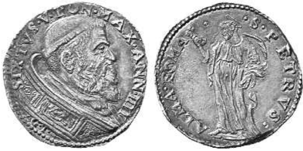
PAPAL COINS Sixtus V., 1585-1590.

Testone. Rome mint. (1588/1589) 31 mm 9,51 g.