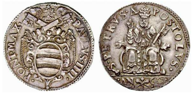
PAPAL COINS Paul IV., 1555-1559.

Estimate: 150 EUR. Price realized: 200 EUR (approx. 265 U.S. Dollars as of the auction date)