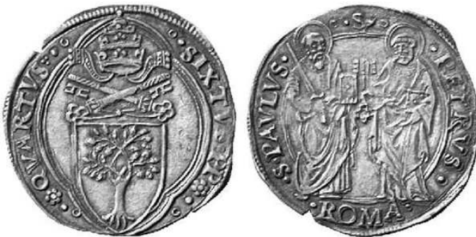
PAPAL COINS Sixtus IV., 1471-1484.

Estimate: 300.00 EUR. Price realized: 475 EUR (approx. 570 U.S. Dollars as of the auction date)