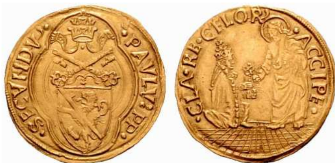
PAPAL COINS Paul II., 1464-1471.