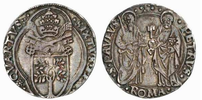
PAPAL COINS Sixtus IV., 1471-1484.

Estimate: 125,00 EUR. Price realized: 170 EUR (approx. 188 U.S. Dollars as of the auction date)