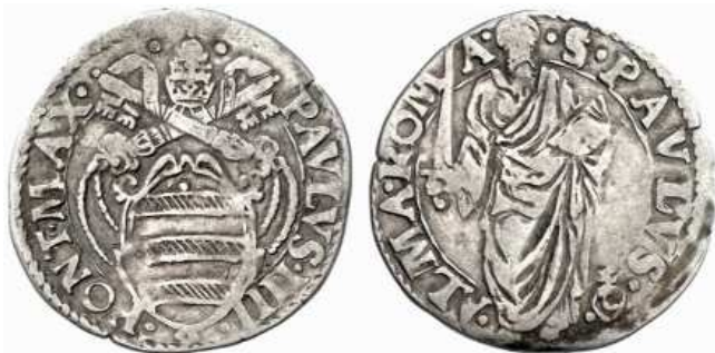
PAPAL COINS Paul IV., 1555-1559.

Starting Price EUR 30. Price realized: 50 EUR (approx. 73 U.S. Dollars as of the auction date)