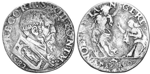
PAPAL COINS Gregory XIII., 1572-1585.

Estimate: 75 EUR. Price realized: 100 EUR (approx. 153 U.S. Dollars as of the auction date)