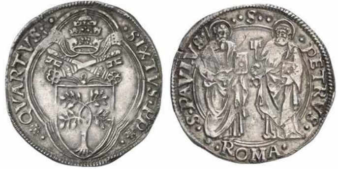
PAPAL COINS Sixtus IV., 1471-1484.

Estimation DM 350. Price realized: 700 DEM (approx. 318 U.S. Dollars as of the auction date)