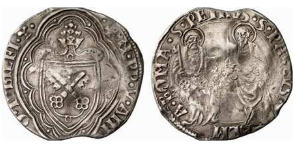
PAPAL COINS Nicolas V., 1447-1455.

Estimate: 750 EUR. Price realized: 1,400 EUR (approx. 2,146 U.S. Dollars as of the auction date)