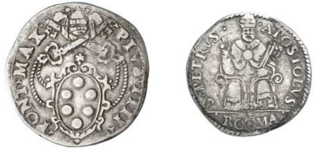
PAPAL COINS Pius IV., 1559-1565.

Estimation DM 250. Price realized: 200 DEM (approx. 91 U.S. Dollars as of the auction date)