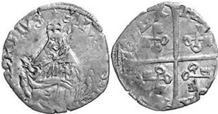
PAPAL COINS Julius III 1550-1555.

Estimation: 150,00. Price realized: 260 EUR (approx. 326 U.S. Dollars as of the auction date)