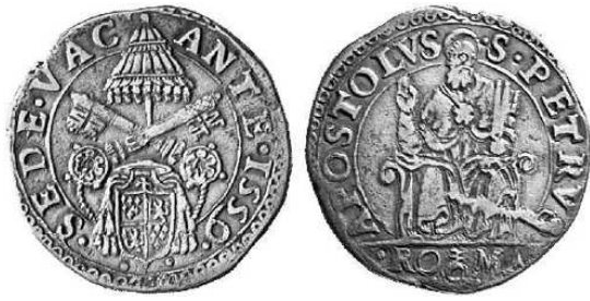
PAPAL COINS Sede Vacante 1559.