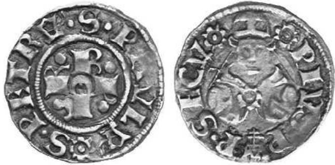
PAPAL COINS Pius II., 1458-1464.

Estimation DM 150. Price realized: 260 DEM (approx. 118 U.S. Dollars as of the auction date)