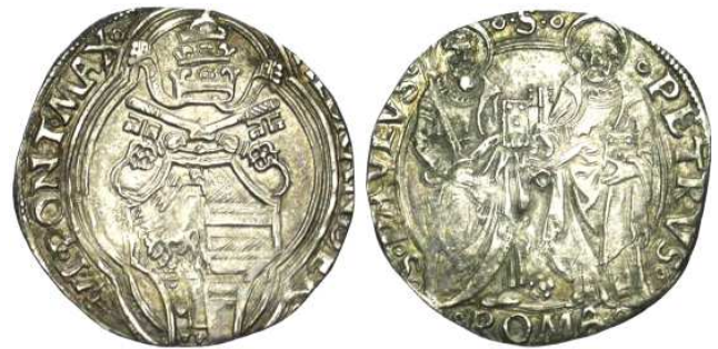
PAPAL COINS Alexander VI., 1492-1503.

Estimate: 100 EUR. Price realized: 320 EUR (approx. 423 U.S. Dollars as of the auction date)