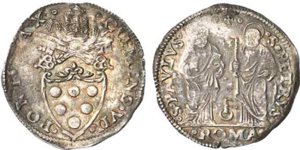
PAPAL COINS Clement VII, 1523-1534.

Estimation DM 300. Price realized: 400 DEM (approx. 182 U.S. Dollars as of the auction date)