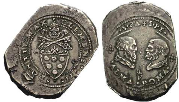
PAPAL COINS Clement VII, 1523-1534.

Estimate CHF 40000. Price realized: 47,000 CHF (approx. 39,170 U.S. Dollars as of the auction date)