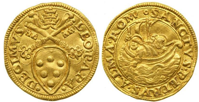
PAPAL COINS Leo X., 1513-1521.

Estimate CHF 30000. Price realized: 44,000 CHF (approx. 36,670 U.S. Dollars as of the auction date)