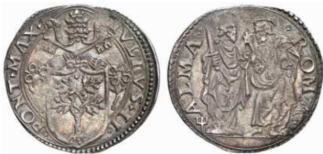
PAPAL COINS Julius II. 1503-1513.

Estimate: 750 EUR. Price realized: 800 EUR (approx. 1,226 U.S. Dollars as of the auction date)