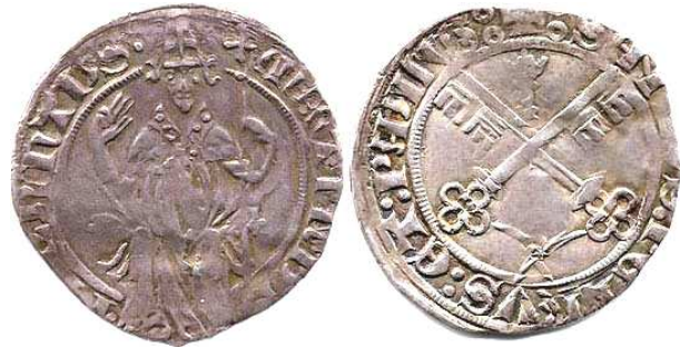
PAPAL COINS Martin V., 1417-1431.

Estimate: 500 EUR. Price realized: 420 EUR (approx. 555 U.S. Dollars as of the auction date)