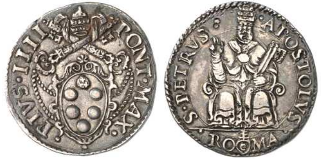
PAPAL COINS Pius IV., 1559-1565.

Estimate: 75 EUR. Price realized: 60 EUR (approx. 92 U.S. Dollars as of the auction date)