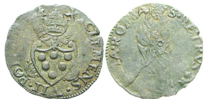
PAPAL COINS Clement VII, 1523-1534.

Estimate: 75 EUR. Price realized: 240 EUR (approx. 368 U.S. Dollars as of the auction date)