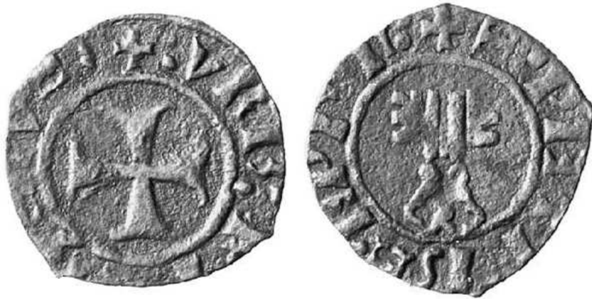
PAPAL COINS Urban VI, 1378-1389.

His successor was Pope Boniface IX (1389–1404).