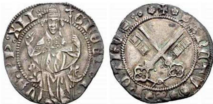
PAPAL COINS Gregory XII., 1406-1417.