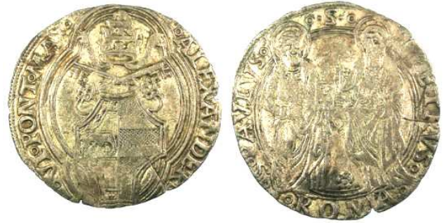
PAPAL COINS Alexander VI., 1492-1503.

Estimate: 200 EUR. Price realized: 750 EUR (approx. 1,150 U.S. Dollars as of the auction date)