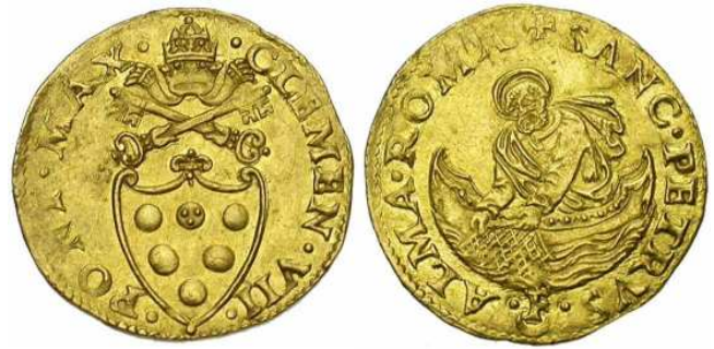
PAPAL COINS Clement VII, 1523-1534.

Estimate: 500.00 EUR. Price realized: 650 EUR (approx. 780 U.S. Dollars as of the auction date)