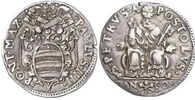
PAPAL COINS Paul IV., 1555-1559.