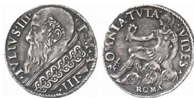
PAPAL COINS Julius III 1550-1555.

Estimate: 100 EUR. Price realized: 80 EUR (approx. 102 U.S. Dollars as of the auction date)