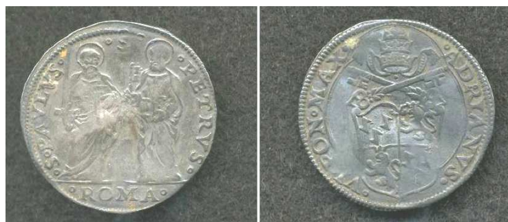
PAPAL COINS Adrian VI, 1522-1523.

Estimate: EUR 200. Price realized: 200 EUR (approx. 297 U.S. Dollars as of the auction date)