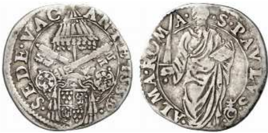
PAPAL COINS Sede Vacante 1559.