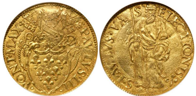
PAPAL COINS Paul III., 1534-1549.

Estimate: £ 500. Price realized: 400 GBP (approx. 718 U.S. Dollars as of the auction date)