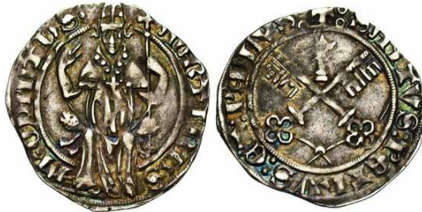
PAPAL COINS Martin V., 1417-1431.