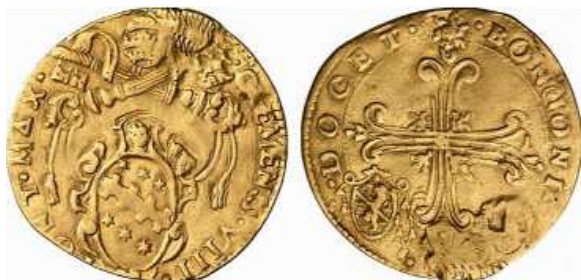
PAPAL COINS Clement VIII., 1592-1605..

Clement VIII founded the Collegio Clementino for the education of the sons of the richer classes, and augmented the number of national colleges in Rome by opening the Collegio Scozzese for the training of missionaries to Scotland.