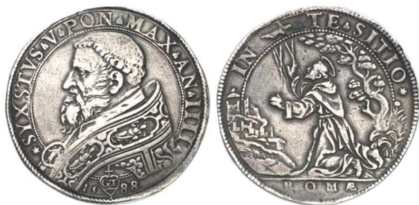
PAPAL COINS Sixtus V., 1585-1590.

Estimate CHF 12500. Price realized: 12,500 CHF (approx. 10,418 U.S. Dollars as of the auction date)