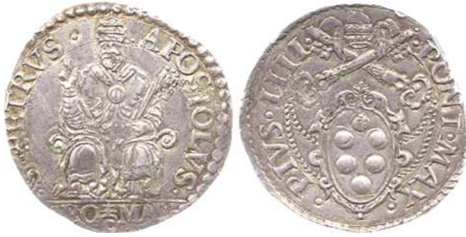
PAPAL COINS Pius IV., 1559-1565.