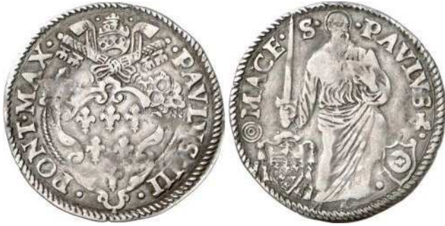
PAPAL COINS Paul III., 1534-1549.