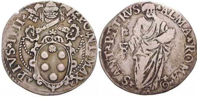
PAPAL COINS Pius IV., 1559-1565.