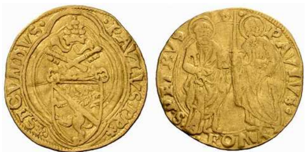
PAPAL COINS Paul II., 1464-1471.

Estimation: EUR 500. Price realized: 600 EUR (approx. 708 U.S. Dollars as of the auction date)