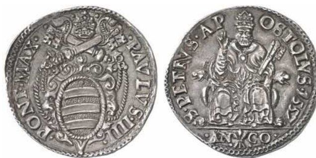
PAPAL COINS Paul IV., 1555-1559.