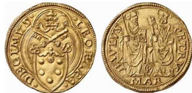
PAPAL COINS Leo X., 1513-1521.

Estimation: CHF 2000. Price realized: 1,700 CHF (approx. 1,375 U.S. Dollars as of the auction date)