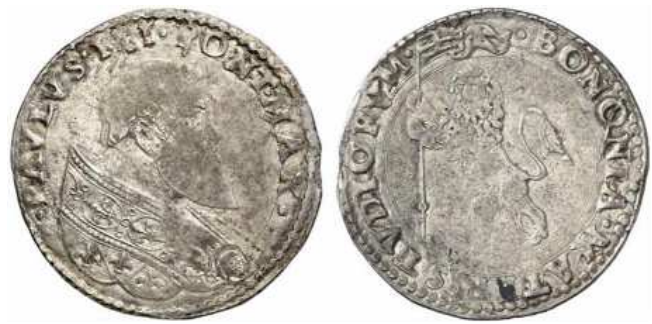
PAPAL COINS Paul III., 1534-1549.

Schätzpreis: 500,00 EUR. Price realized: 6,800 EUR (approx. 8,221 U.S. Dollars as of the auction date)