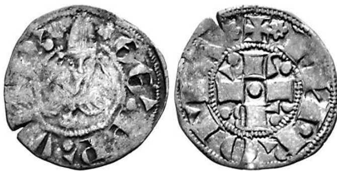
PAPAL COINS Gregory XI., 1370-1378.

Estimate: 50 EUR. Price realized: 180 EUR (approx. 276 U.S. Dollars as of the auction date)