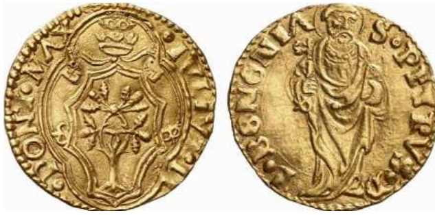
PAPAL COINS Julius II. 1503-1513.