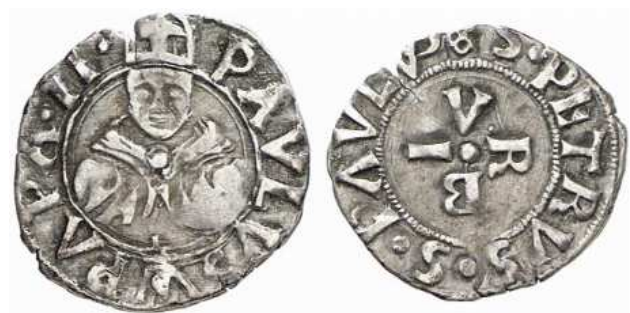
PAPAL COINS Paul II., 1464-1471.

Estimation DM 150. Price realized: 190 DEM (approx. 86 U.S. Dollars as of the auction date)