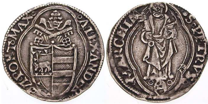
PAPAL COINS Alexander VI., 1492-1503.