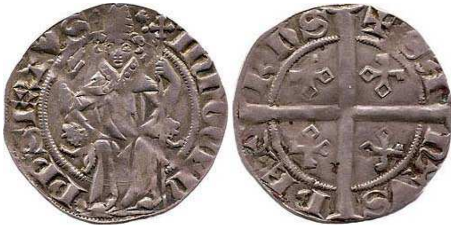
PAPAL COINS Innocent VI., 1352-1362.