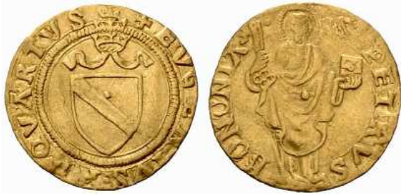
PAPAL COINS Eugenius IV., 1431-1447.