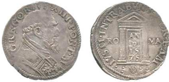
PAPAL COINS Gregory XIII., 1572-1585.