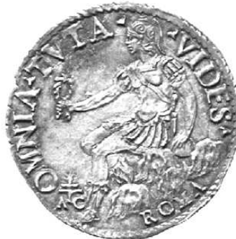
PAPAL COINS Julius III 1550-1555.