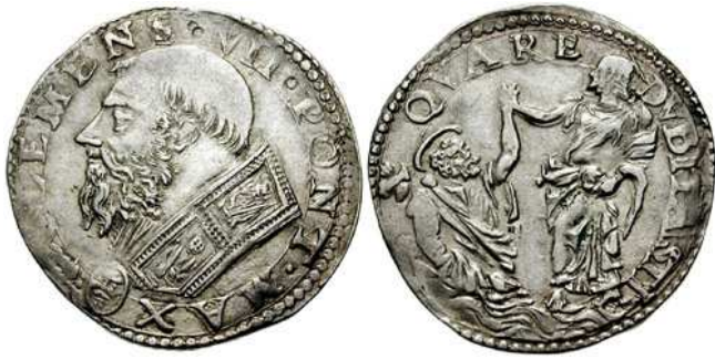
PAPAL COINS Clement VII, 1523-1534.

Double Carlino. (1-1/2 Giulio) Rome mint. 5,36 g.