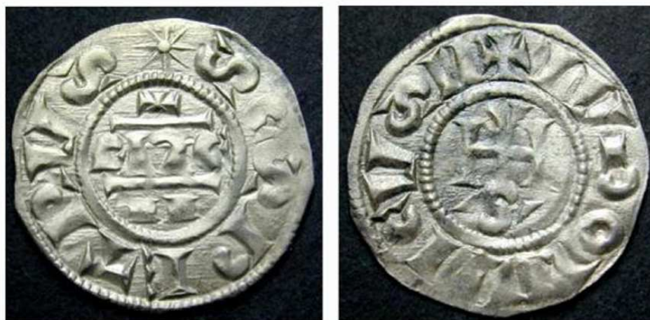
PAPAL COINS GREGORY IV (827-844) with LOUIS the PIOUS

Gregory contributed to the architectural development of Rome (he rebuilt the Basilica di San Marco) and promoted the celebration of the feast of All Saints.