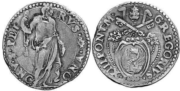
PAPAL COINS Gregory XIII., 1572-1585.

Estimate: CHF 1650 / euro 1056. Price realized: 1,850 CHF (approx. 1,506 U.S. Dollars as of the auction date)