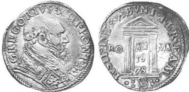
PAPAL COINS Gregory XIII., 1572-1585.

Estimate: EUR 200. Price realized: 425 EUR (approx. 566 U.S. Dollars as of the auction date)