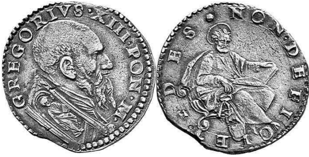
PAPAL COINS Gregory XIII., 1572-1585.