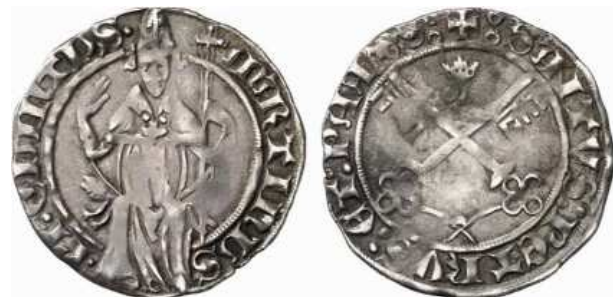
PAPAL COINS Martin V., 1417-1431.