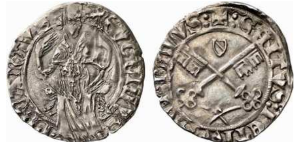
PAPAL COINS Eugenius IV., 1431-1447.

Estimate: 200 EUR. Price realized: 480 EUR (approx. 736 U.S. Dollars as of the auction date)