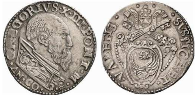
PAPAL COINS Gregory XIII., 1572-1585.

Estimate CHF 400. Price realized: 550 CHF (approx. 407 U.S. Dollars as of the auction date)