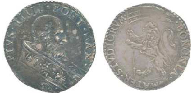
PAPAL COINS Pius V 1566-1572.

Estimation CHF 200. Price realized: 425 CHF (approx. 323 U.S. Dollars as of the auction date)