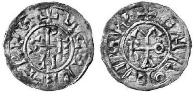
PAPAL COINS STEPHEN V with CHARLES THE FAT (885-891)

Estimate: 3000 CHF. Price realized: 4,100 CHF (approx. 3,928 U.S. Dollars as of the auction date)