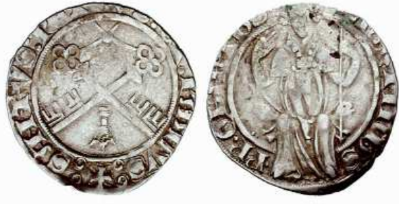
PAPAL COINS Martin V., 1417-1431.