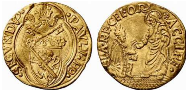
PAPAL COINS Paul II., 1464-1471.

After Paul II's death, one of his successors suggested that he should be called Maria Pietissima, "Our Lady of Pity", because he was inclined to break into tears at times of crisis. However, some commentators have suggested that the nickname was rather due to Paul II's propensity to enjoy dressing up in sumptuous ecclesiastical finery, though there is a possibility that the rumours of homosexuality may have been introduced by critics to undermine his reputation.