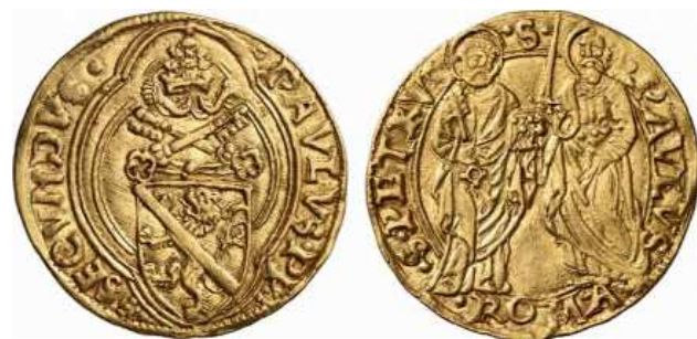
PAPAL COINS Paul II., 1464-1471.

Estimate: EUR 400. Price realized: 320 EUR (approx. 475 U.S. Dollars as of the auction date)