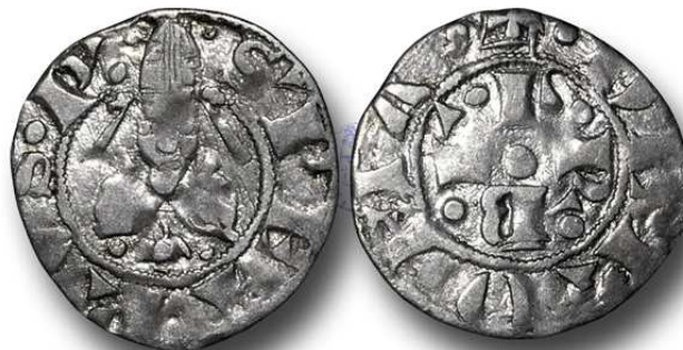
PAPAL COINS Gregory XI., 1370-1378.

Estimate CHF 350. Price realized: 480 CHF (approx. 355 U.S. Dollars as of the auction date)