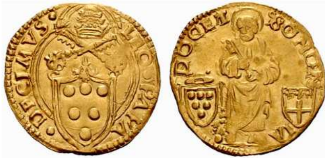
PAPAL COINS Leo X., 1513-1521.