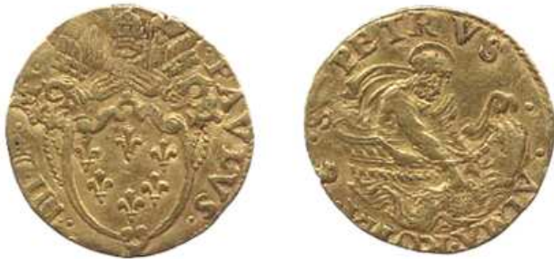
PAPAL COINS Paul III., 1534-1549.

Estimate: 1250 EUR. Price realized: 1,400 EUR (approx. 2,146 U.S. Dollars as of the auction date)