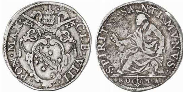
PAPAL COINS Clement VIII., 1592-1605..

Estimation: 125,00. Price realized: 230 EUR (approx. 289 U.S. Dollars as of the auction date)