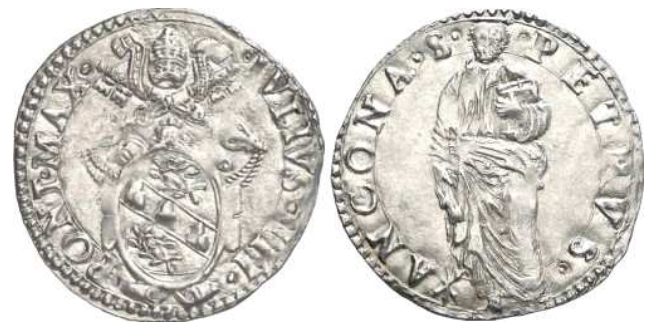
PAPAL COINS Julius III 1550-1555.

Estimation: 150,00. Price realized: 200 EUR (approx. 251 U.S. Dollars as of the auction date)