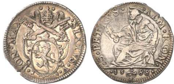
PAPAL COINS Sixtus V., 1585-1590.

Estimation DM 250. Price realized: 900 DEM (approx. 409 U.S. Dollars as of the auction date)