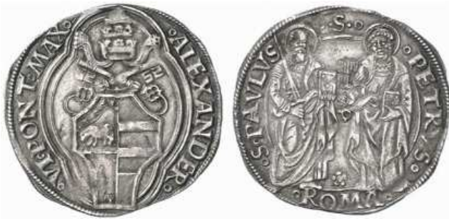
PAPAL COINS Alexander VI., 1492-1503.