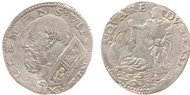
PAPAL COINS Clement VII, 1523-1534.

Estimate: $4000. Price realized: 4,600 USD.