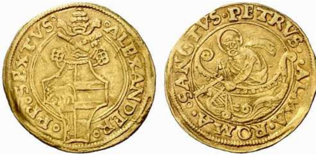
PAPAL COINS Alexander VI., 1492-1503.

Fiorini di camera. Rome mint. 24 mm 3,30 g.