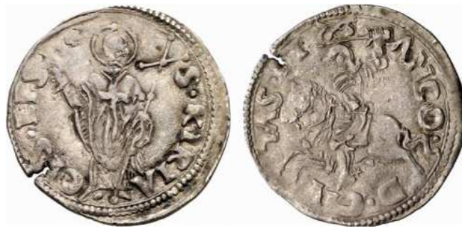
PAPAL COINS Anonymous issue under Clement VII, 1523-1534.

Estimate: 75 EUR. Price realized: 240 EUR (approx. 368 U.S. Dollars as of the auction date)