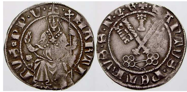
PAPAL COINS Martin V., 1417-1431.

Estimate: EUR 50. Price realized: 85 EUR (approx. 100 U.S. Dollars as of the auction date)