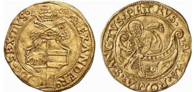
PAPAL COINS Alexander VI., 1492-1503.

Estimate: EUR 600. Price realized: 660 EUR (approx. 979 U.S. Dollars as of the auction date)