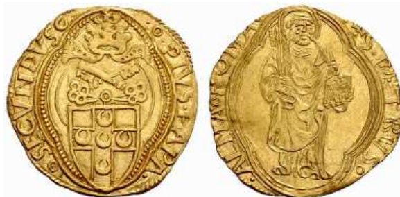
PAPAL COINS Pius II., 1458-1464.

Pope Pius II inaugurated an unusual urban project, perhaps the first city planning exercise in modern Europe. He refurbished his home town which is now by his name called Pienza (province of Siena, Tuscany). A cathedral and palaces were built in the best style of the day to decorate the city. They survive to this day.