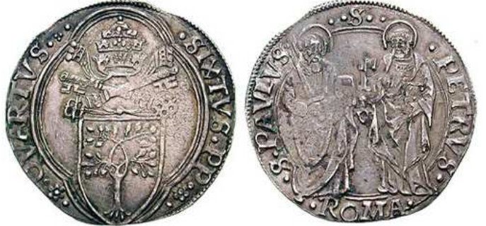
PAPAL COINS Sixtus IV., 1471-1484.

Estimate: EUR 30. Price realized: 230 EUR (approx. 276 U.S. Dollars as of the auction date)