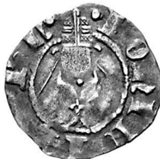
PAPAL COINS Boniface IX., 1389-1404.