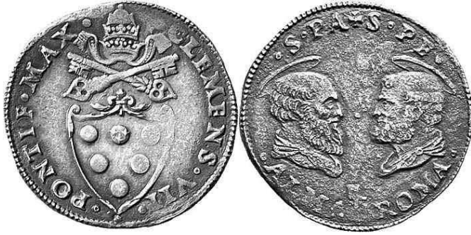
PAPAL COINS Clement VII, 1523-1534.