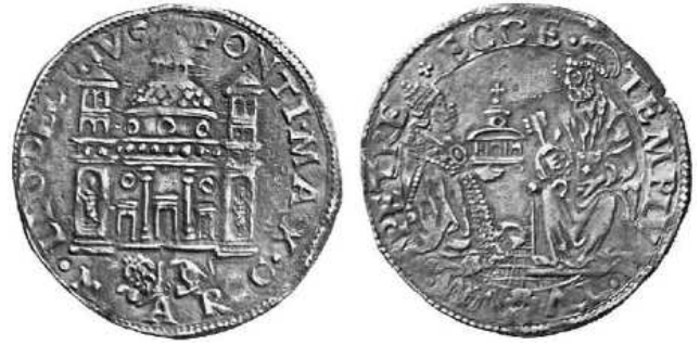
PAPAL COINS Leo X., 1513-1521.

Estimate: $3000. Price realized: 3,750 USD.