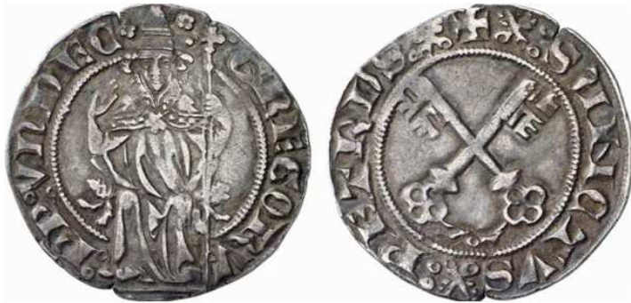
PAPAL COINS Gregory XI., 1370-1378.