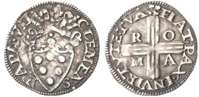
PAPAL COINS Clement VII, 1523-1534.

Estimation DM 300. Price realized: 1,100 DEM (approx. 499 U.S. Dollars as of the auction date)