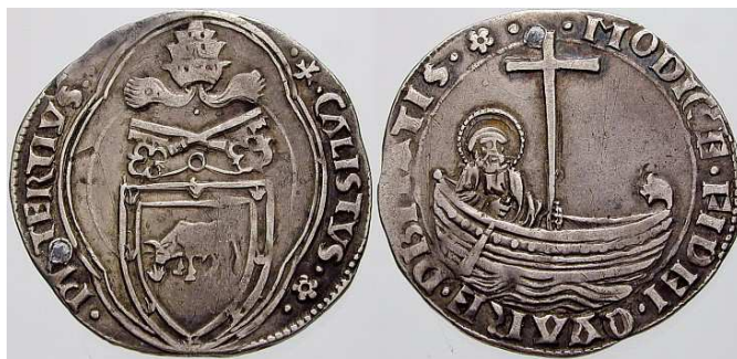
PAPAL COINS Calixtus III., 1455-1458.

Estimate: 800 EUR. Price realized: 1,200 EUR (approx. 1,839 U.S. Dollars as of the auction date)