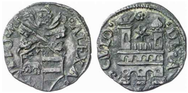
PAPAL COINS Alexander VI., 1492-1503.

Estimation DM 250. Price realized: 725 DEM (approx. 329 U.S. Dollars as of the auction date)