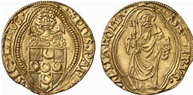
PAPAL COINS Pius II., 1458-1464.

Estimate: 1250 EUR. Price realized: 1,800 EUR (approx. 2,759 U.S. Dollars as of the auction date)