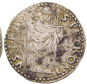
PAPAL COINS Julius III 1550-1555.