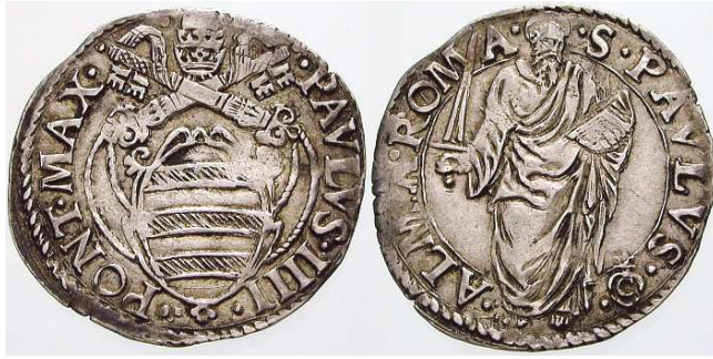
PAPAL COINS Paul IV., 1555-1559.