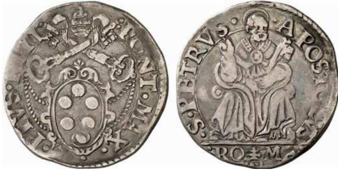
PAPAL COINS Pius IV., 1559-1565.