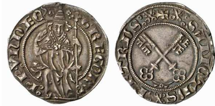
PAPAL COINS Gregory XI., 1370-1378.

Estimate: 300 EUR. Price realized: 650 EUR (approx. 996 U.S. Dollars as of the auction date)