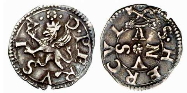
PAPAL COINS Anonymous issue, 16th Century, time of Leo X., 1513-1521.

Estimate: 75 EUR. Price realized: 105 EUR (approx. 125 U.S. Dollars as of the auction date)