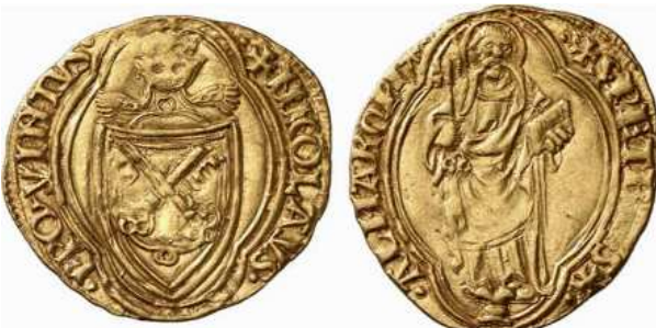
PAPAL COINS Nicolas V., 1447-1455.

Estimate: EUR 550. Price realized: 800 EUR (approx. 1,187 U.S. Dollars as of the auction date)