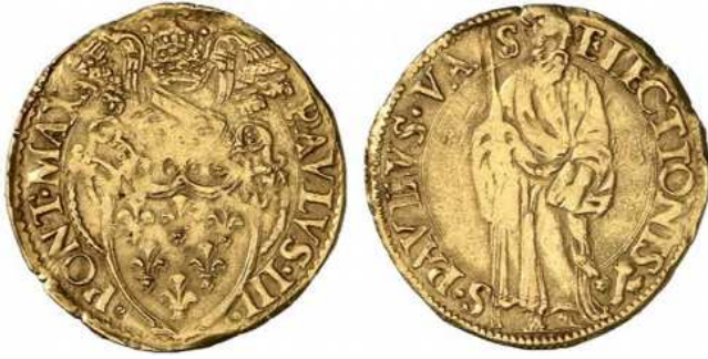
PAPAL COINS Paul III., 1534-1549.