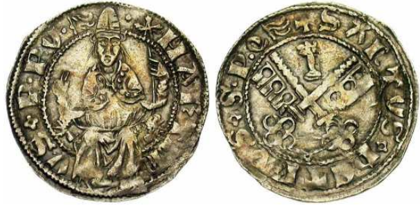
PAPAL COINS Martin V., 1417-1431.

Schätzpreis: 150.00 EUR. Price realized: 260 EUR (approx. 312 U.S. Dollars as of the auction date)