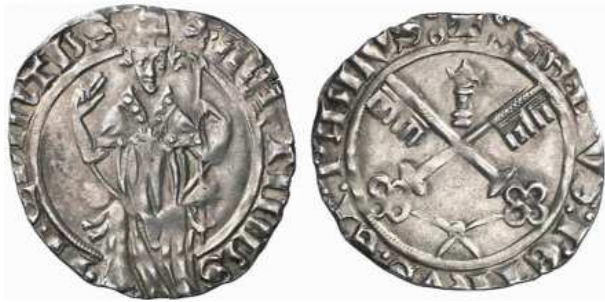
PAPAL COINS Martin V., 1417-1431.