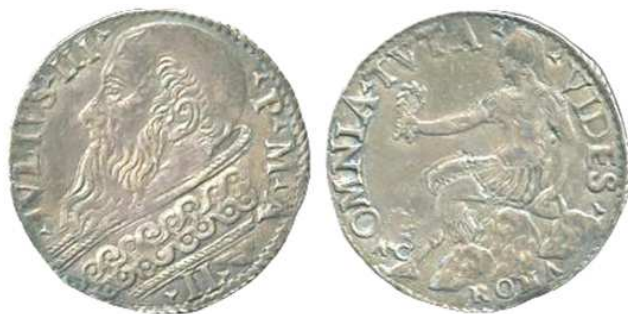
PAPAL COINS Julius III 1550-1555.