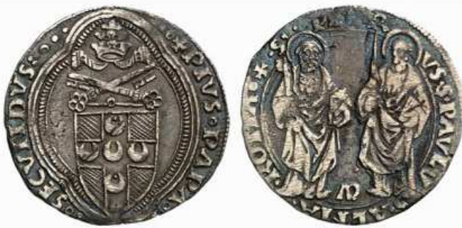
PAPAL COINS Pius II., 1458-1464.