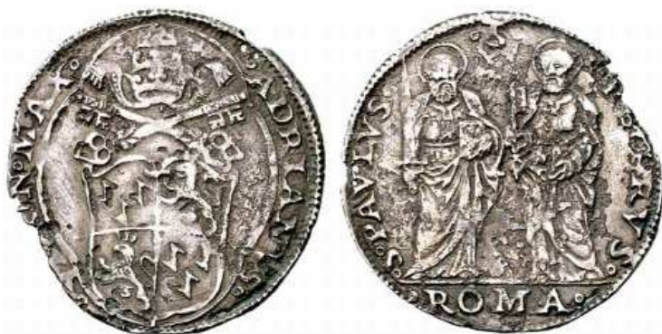
PAPAL COINS Adrian VI, 1522-1523.

Italian writer Luigi Malerba used the confusion among the leaders of the Roman Catholic Church, which was created by Adrian's unexpected election, as backdrop for his amusing 1995 novel, Le maschere (The Masks), about the struggle between two Roman cardinals for a well-endowed church office.