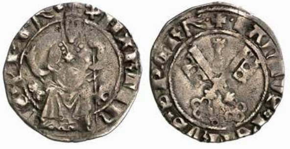
PAPAL COINS Martin V., 1417-1431.