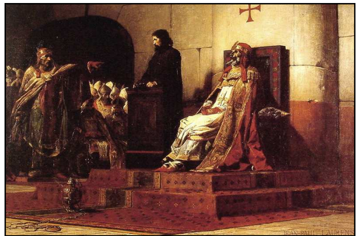
Jean Paul Laurens Le Pape Formose et Etienne VII 1870

Formosus persuaded Arnulf of Carinthia to advance to Rome, invade the Italian peninsula, and take control of Italy. In 894, Arnulf's army occupied all the country north of the Po River. Guido died in December, leaving his son Lambert in the care of his mother Agiltrude, an opponent of the Carolingians. In autumn 895 Arnulf undertook his second Italian campaign, and in 896 he was crowned by the Pope in Rome. The new emperor moved against Spoleto but was struck with paralysis on the way and was unable to continue the campaign.