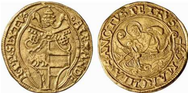
PAPAL COINS Alexander VI., 1492-1503.

Estimate: 1000 EUR. Price realized: 1,850 EUR (approx. 2,836 U.S. Dollars as of the auction date)