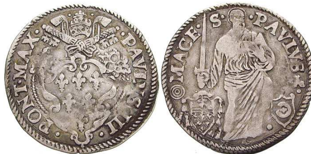
PAPAL COINS Paul III., 1534-1549.

Estimate: EUR 20. Price realized: 40 EUR (approx. 48 U.S. Dollars as of the auction date)