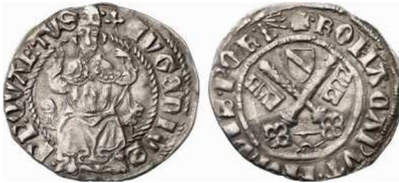
PAPAL COINS Eugenius IV., 1431-1447.

Estimate: 400 EUR. Price realized: 700 EUR (approx. 1,073 U.S. Dollars as of the auction date)