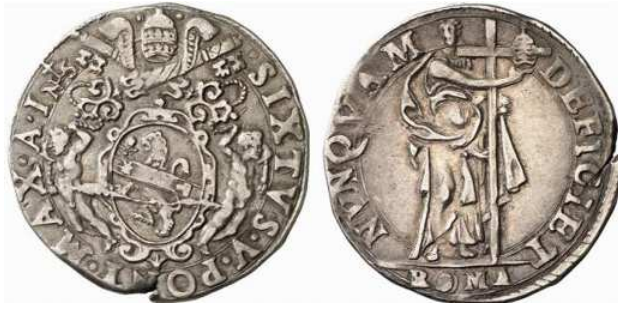
PAPAL COINS Sixtus V., 1585-1590.

Testone. Anno I. Rome mint. 31 mm 9,35 g.