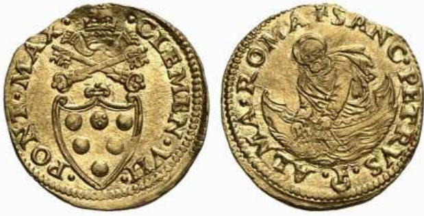
PAPAL COINS Clement VII, 1523-1534.