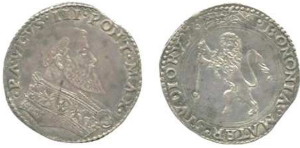
PAPAL COINS Paul III., 1534-1549.