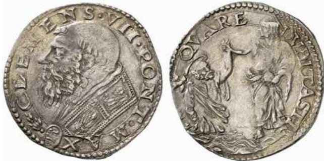
PAPAL COINS Clement VII, 1523-1534.

Estimate: US$2400. Price realized: 2,000 USD