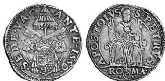
PAPAL COINS Sede Vacante 1559.

Estimate: 200.00 EUR. Price realized: 360 EUR (approx. 432 U.S. Dollars as of the auction date)