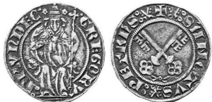
PAPAL COINS Gregory XI., 1370-1378.

Schätzpreis: 300.00 EUR. Price realized: 900 EUR (approx. 1,080 U.S. Dollars as of the auction date)