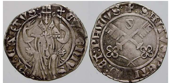
PAPAL COINS Eugenius IV., 1431-1447.

Estimate: EUR 200. Price realized: 380 EUR (approx. 564 U.S. Dollars as of the auction date)