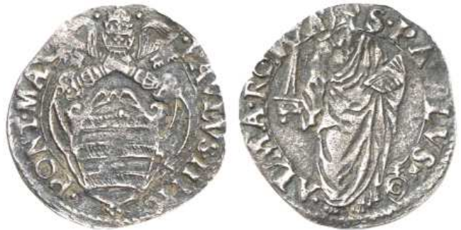
PAPAL COINS Paul IV., 1555-1559.