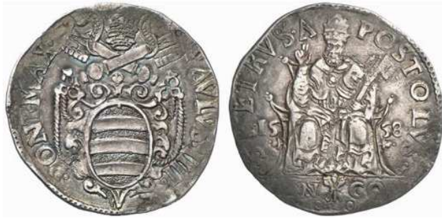
PAPAL COINS Paul IV., 1555-1559.