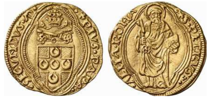
PAPAL COINS Pius II., 1458-1464.

Estimate: EUR 1800. Price realized: 1,600 EUR (approx. 2,374 U.S. Dollars as of the auction date)