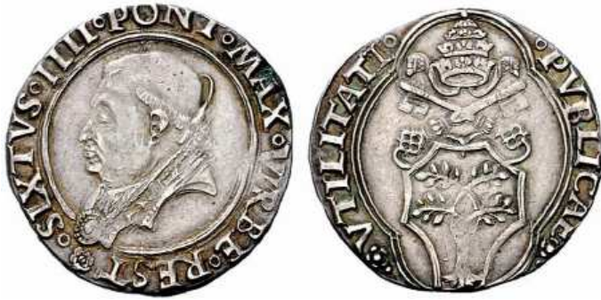
PAPAL COINS Sixtus IV., 1471-1484.