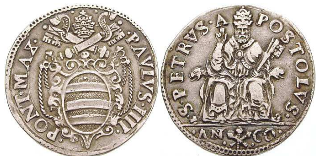
PAPAL COINS Paul IV., 1555-1559.

Estimate: 250 EUR. Price realized: 200 EUR (approx. 259 U.S. Dollars as of the auction date)