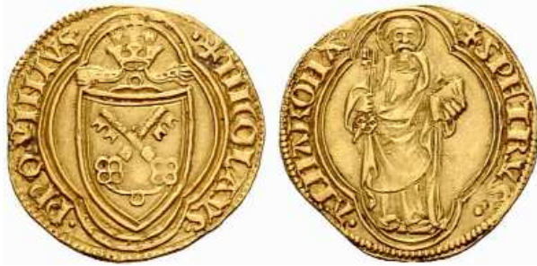
PAPAL COINS Nicolas V., 1447-1455.

In undertaking these works Nicholas V was moved "to strengthen the weak faith of the populace by the greatness of that which it sees". The Roman populace, however, appreciated neither his motives nor their results, and in 1452 a formidable conspiracy for the overthrow of the papal government, under the leadership of Stefano Porcaro, was discovered and crushed. This revelation of disaffection, together with the fall of Constantinople in 1453, darkened the last years of Pope Nicholas V; "As Thomas of Sarzana," he said, "I had more happiness in a day than now in a whole year".