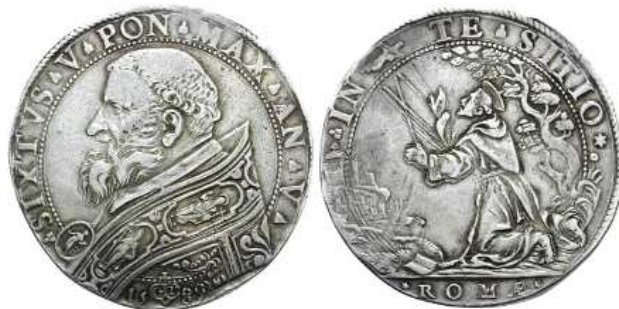
PAPAL COINS Sixtus V., 1585-1590.

Estimation: £ 1000. Price realized: 1,250 GBP (approx. 1,777 U.S. Dollars as of the auction date)