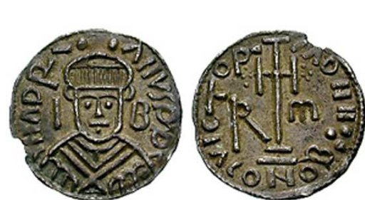
PAPAL COINS HADRIAN I. 772-795.

AR Denaro. Struck circa 781-795. 1.27 g.