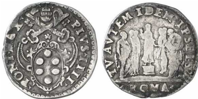
PAPAL COINS Pius IV., 1559-1565.

Estimate: 100.00 EUR. Price realized: 145 EUR (approx. 174 U.S. Dollars as of the auction date)