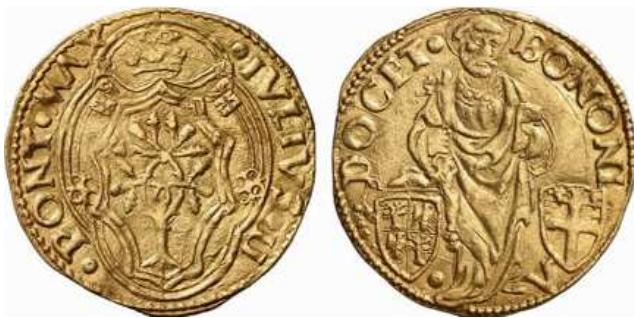
PAPAL COINS Julius II. 1503-1513.

Estimate: 1.500 EUR. Price realized: 1,200 EUR (approx. 1,523 U.S. Dollars as of the auction date)