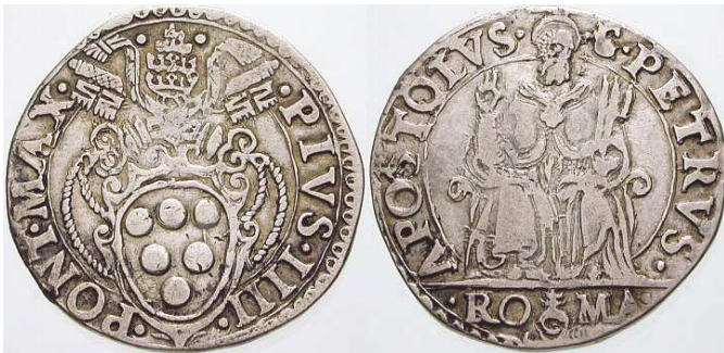
PAPAL COINS Pius IV., 1559-1565.

Estimate: 150.00 EUR. Price realized: 270 EUR (approx. 324 U.S. Dollars as of the auction date)