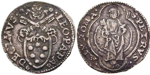
PAPAL COINS Leo X., 1513-1521.