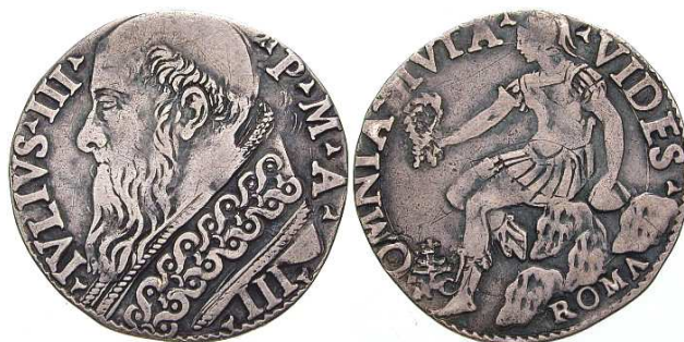
PAPAL COINS Julius III 1550-1555.

Estimate: £ 500. Price realized: 620 GBP (approx. 1,178 U.S. Dollars as of the auction date)