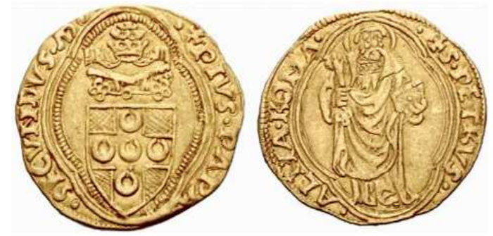
PAPAL COINS Pius II., 1458-1464.

Estimate: 750 EUR. Price realized: 2,400 EUR (approx. 3,679 U.S. Dollars as of the auction date)