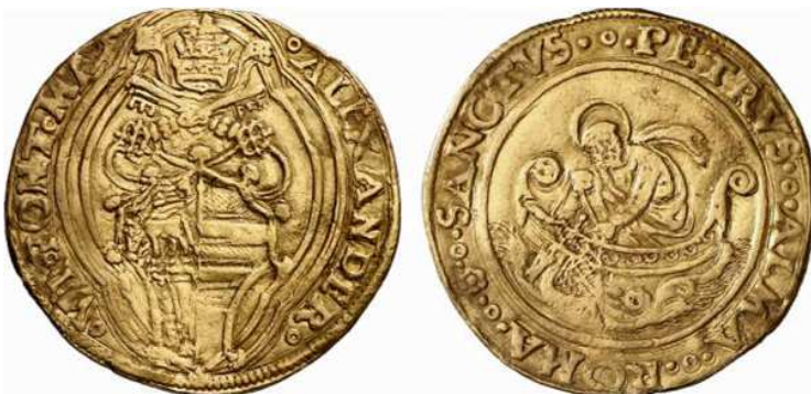
PAPAL COINS Alexander VI., 1492-1503.

He is the ancestor of virtually all Royal Houses of Europe, mainly the Southern and Western ones, for being the ancestor of Doña Luisa de Guzmán, wife of King John IV of Portugal.