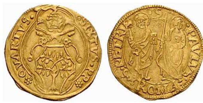
PAPAL COINS Sixtus IV., 1471-1484.

Estimated Value $3,000-3,500. Price realized: 5,000 USD.