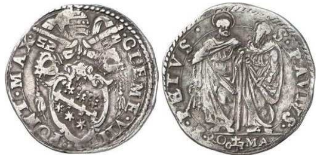
PAPAL COINS Clement VIII., 1592-1605..

Estimate: EUR 180. Price realized: 130 EUR (approx. 193 U.S. Dollars as of the auction date)